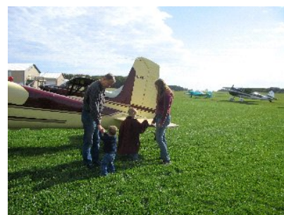
Museum Closes with Picnic and Special Opening for 1414 Pancake Breakfast