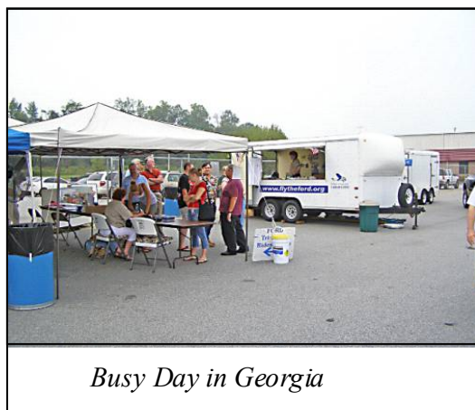
Busy Day in Georgia