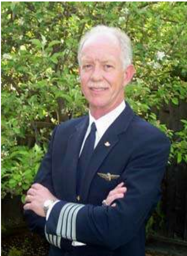
Captain Chesley Sullenberger