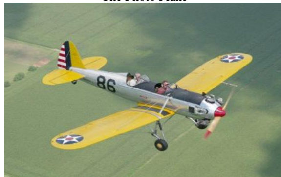
WHAT A VIEW!