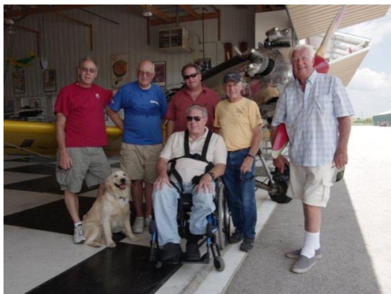
The Flight Team