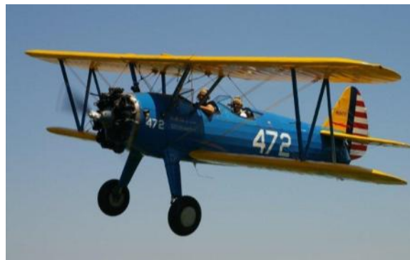
The Photo Plane