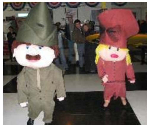
The Little People