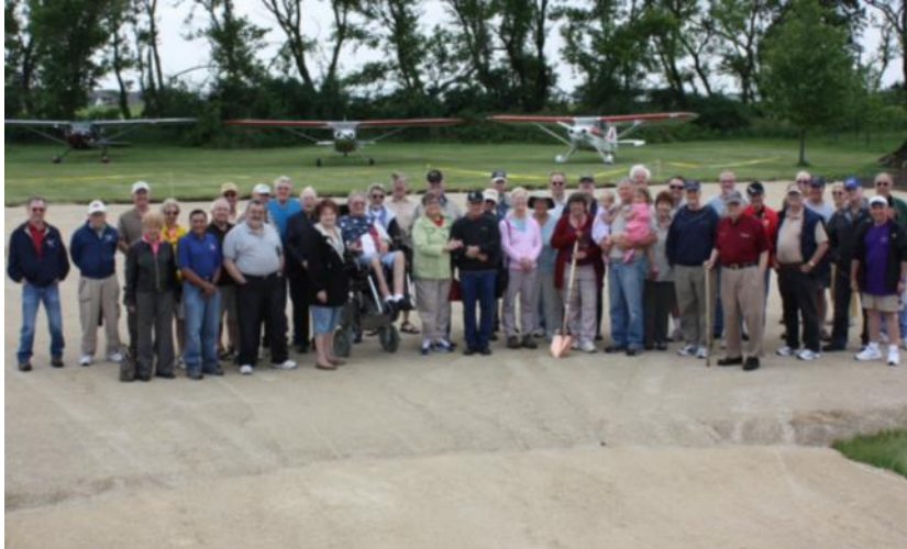
Ground Breaking Ceremony Saturday, May 26, 2012