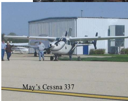
May's Cessna 337