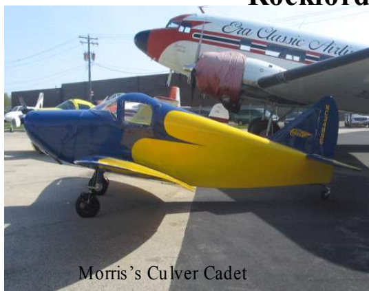
Morris's Culver Cadet