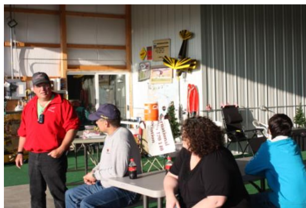
Cessna 120/140 Campout