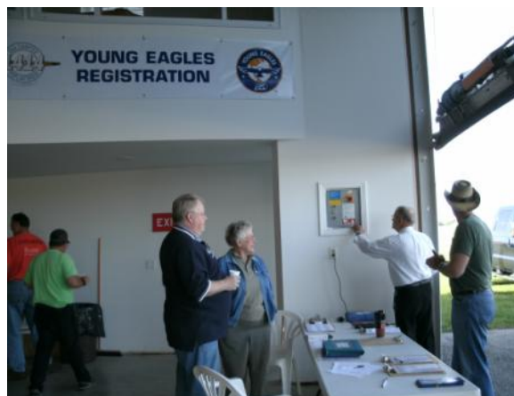
Young Eagles Pilots and Ground Crew