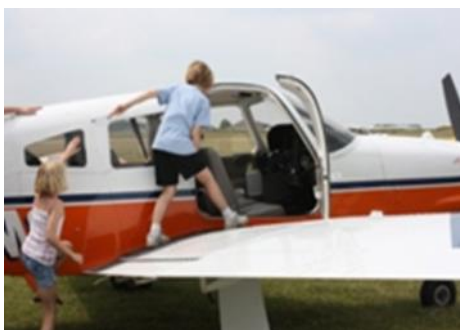
More Young Eagles recruited.