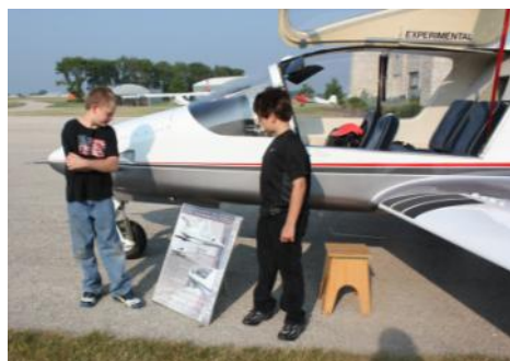
Young Eagles admire the Prescott.