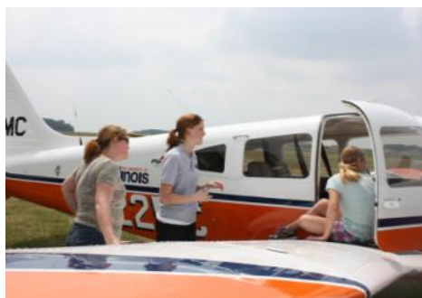
U of I Champaign-Urbana Aviation Department recruits a Young Eagle.