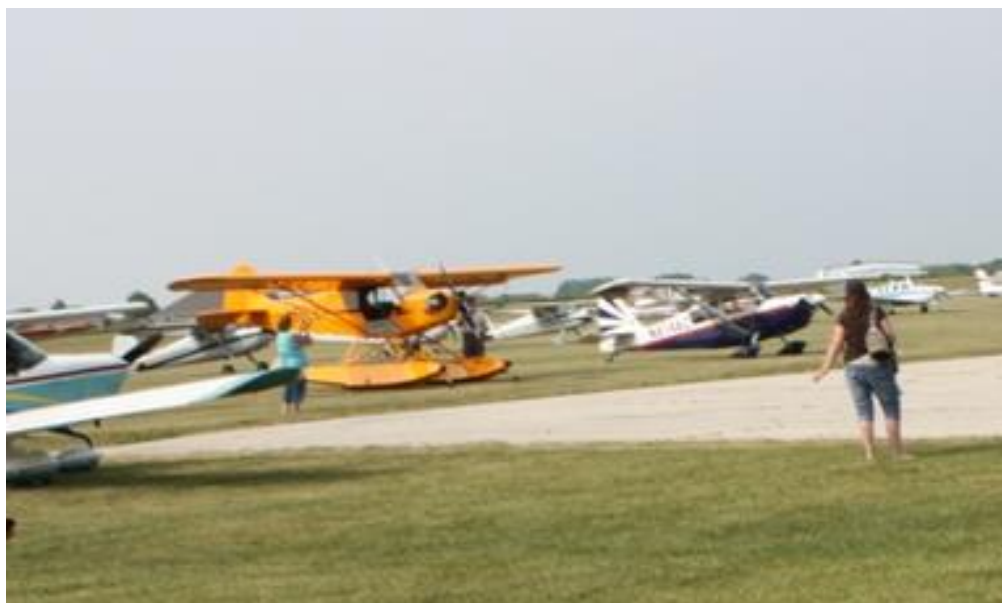
After an overcast morning, the sun broke out and brought a large amount of fly-in traffic.