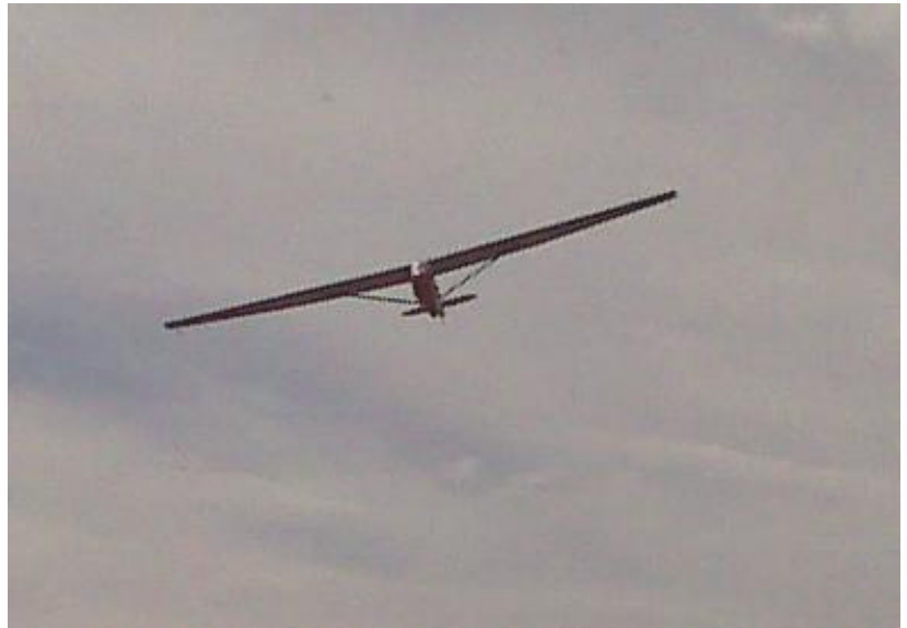
Glider Plane Outing See Page 2.

Promote, encourage and facilitate an environment that fosters safety, education and high standards in the design, construction, resto- ration and operation of all types of recreational aircraft, as well as, nurture camaraderie and friendship amongst all members!