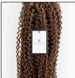
KINKY CURLY (COMING SOON)