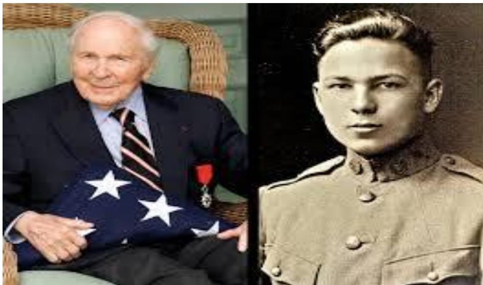
Frank Buckles US Army