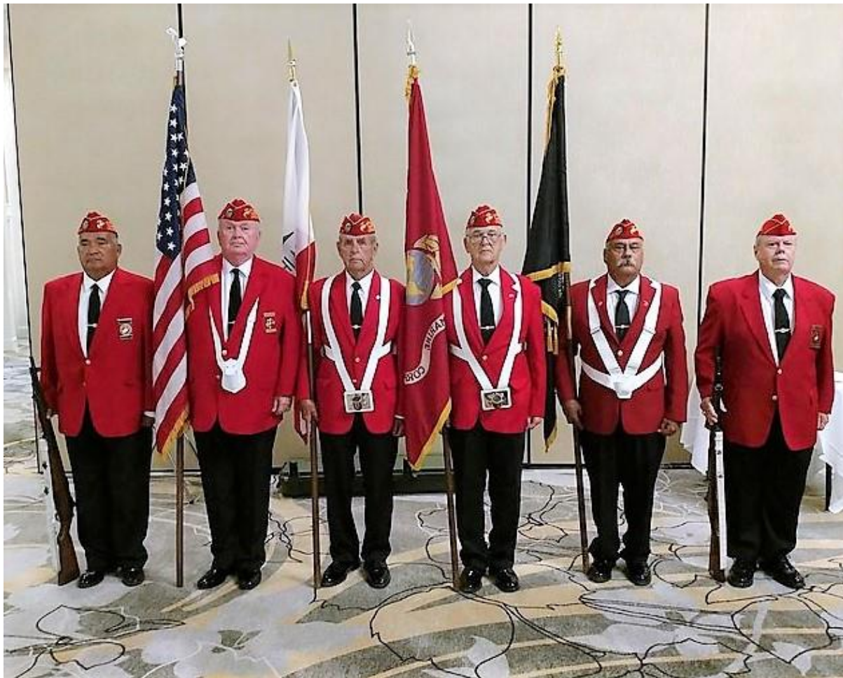
City of Commerce Formal Banquet