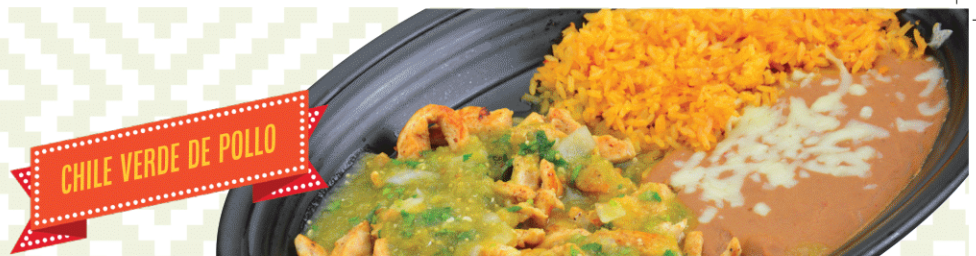
CHILE VERDE DE POLLO

Grilled marinated chicken breast covered with fresh sliced mushrooms, spinach, bell peppers, onions and smothered with our special cheese sauce. Served with rice, beans and tortillas. 17.99