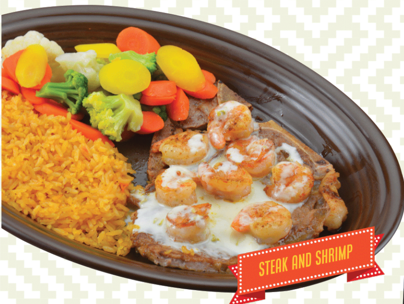
STEAK AND SHRIMP

T-bone steak served with cheese on top, rice and vegetables. 23.99