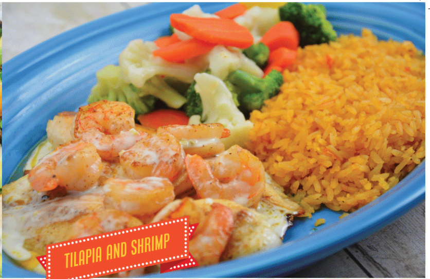
TILAPIA AND SHRIMP