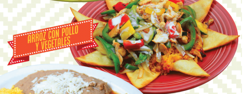
ARROZ CON POLLO Y VEGETALES