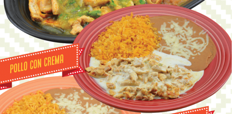
POLLO CON CREMA