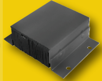
With Face plate