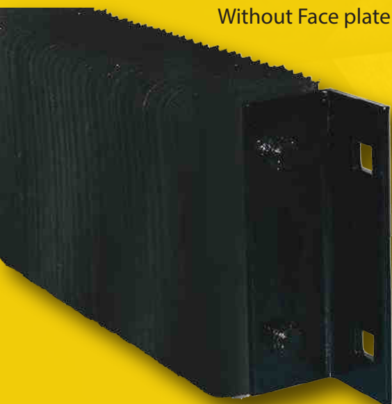
Without Face plate

Bulwark Dock Bumpers are easily installed, they are long lasting to protect dock equipment, building walls and truck cargo from potential damage.