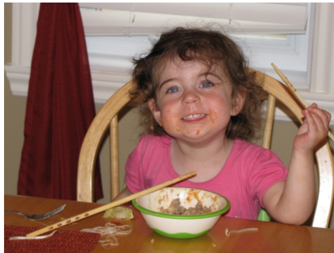
Figure 1. Children learn about food through exploration with their senses

tensities of these aversive reactions may lead to food refusals that may get generalized to foods with similar characteristics or to all new foods. Some children are so sensitive to the sensory characteristics of the rejected food that they will not eat any other food that comes in contact with the refused food, or refuse that certain foods be placed in their line of vision, or refuse to eat when others, seated next to them, eat a food that has been rejected or it may trigger an aversive reaction (Figure 1). What distinguishes Sensory Food Aversions from normal food preferences is the degree of severity of the food refusal and the presence of nutritional deficiencies or oral-motor delays arising from a lack of exposure to more demanding food textures [33]. Some studies have shown a significant relationship between food selectivity or mealtime problems and problems with sensory modulation [26, 40].