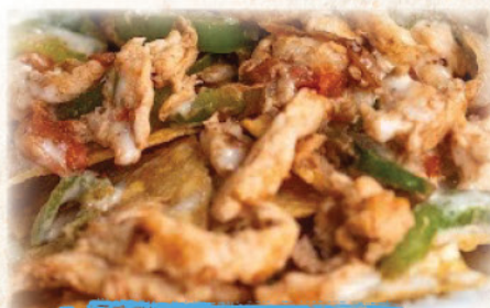
NACHOS FAJITA CHICKEN

A bed of lettuce with sour cream a slice of tomato and shredded cheese.