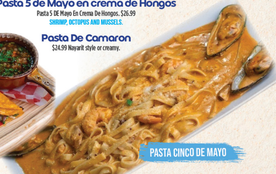
PASTA CINCO DE MAYO

Pasta De Camaron $24.99 Nayarit style or creamy.