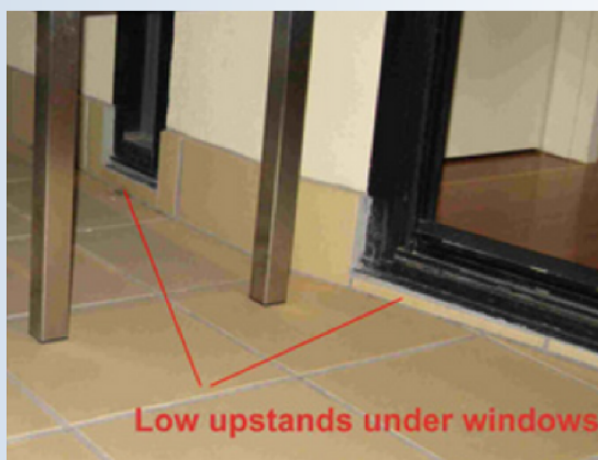
Figure 3 – Low up-stands under window

These up-stands are only about 15 mm in height and even though this deck was in a sheltered position water still entered the dwelling behind the window doorway.