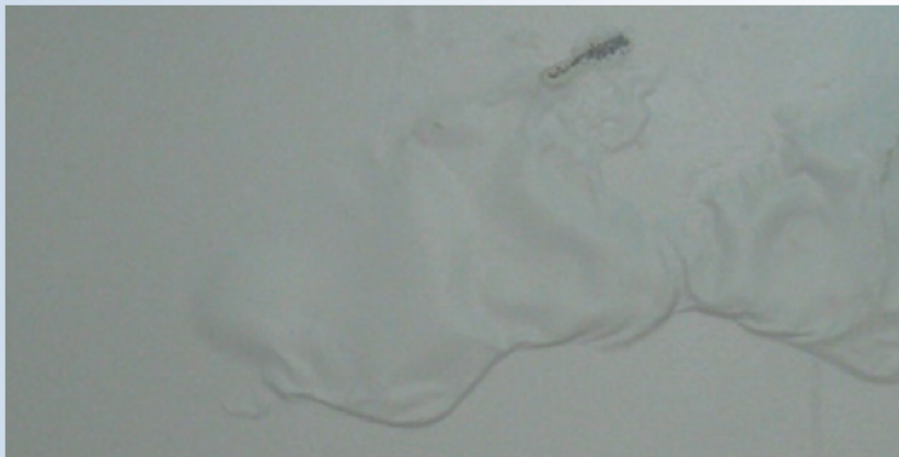
Figure 4 – Blistering of paint finish by water vapour

These habitable rooms built below ground level will have remain to serviceable for the life of the building.