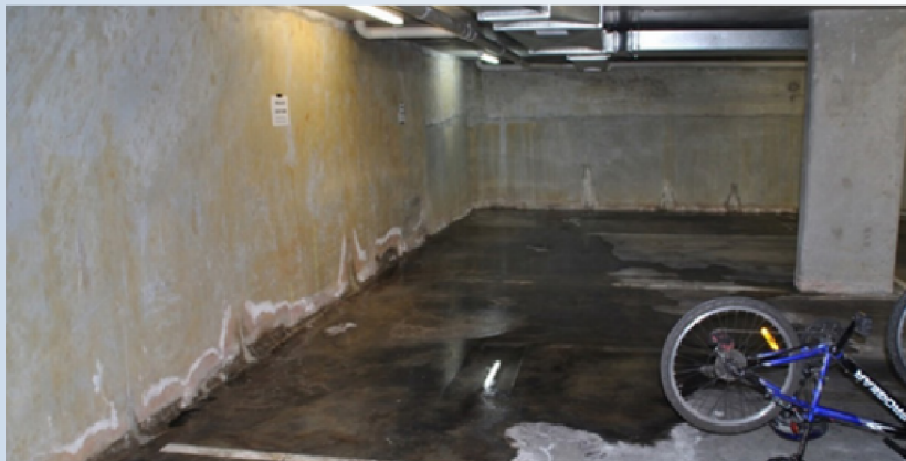
Figure 1 - Flooding of the floor of a car park basement by leaking at the floor-wall junction

With metal decking supporting the concrete roof it is very difficult to trace the source of the surface leak as the water flows along the metal deck surface before it shows up on the under surface. In the event of such a leak occurring it is often easier to install a channel drain under the leak which will prevent dripping onto vehicles parked below.