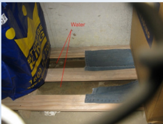
Figure 3 – Storage cage with water flowing in the drain at the wall-floor junction

Once vapour condenses it can pick up salts from the wall resulting in flacking of the internal finish as shown in Figure 4.