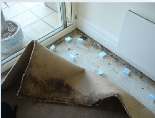
Figure 1 – Carpet damage behind doorway

The damage to the carpet behind the doorway onto a deck that was in a high wind exposure location is shown in Figure 1 with the lack of required up-stand below the doorway sill shown in Figure 2.