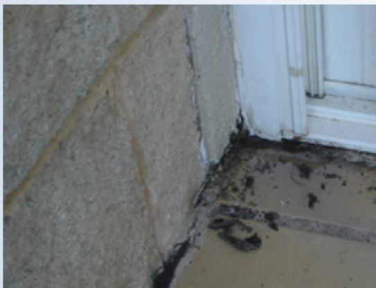
Figure 2 – Windowsill located directly onto level of deck

This deck was located the other side of a roadway fronting onto a sea front with the deck facing to the south-west, so it was exposed to major wind driven rain from the west to the south.