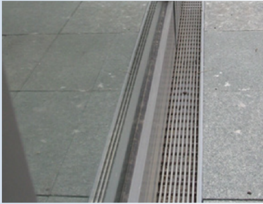
Figure 4 – Grate drain installed across a doorway

In these situations it may be worthwhile looking at having a syphon drainage system made to move the water away from these grate drains as these syphon systems suck the water out below atmospheric pressure which results in much lower water levels in the drainage trough so the drainage grate does not need to be as deep.