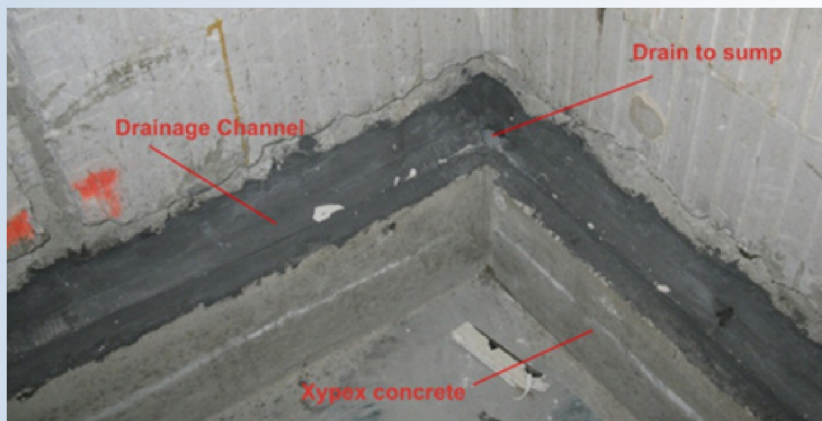
Figure 5 – Basement before installation of the plasterboard wall supported on metal battens