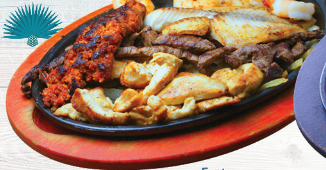
Fajitas Mary y Tierra