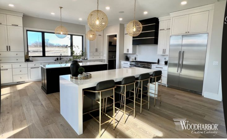
Cabinetry for all Rooms and Budgets

Stop by these Fall Parade of Homes to see our cabinetry