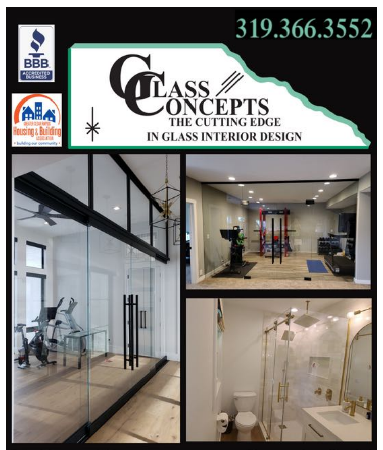
1860 McCloud PL NE • CR, IA 52402 www.glassconceptsiowa.com