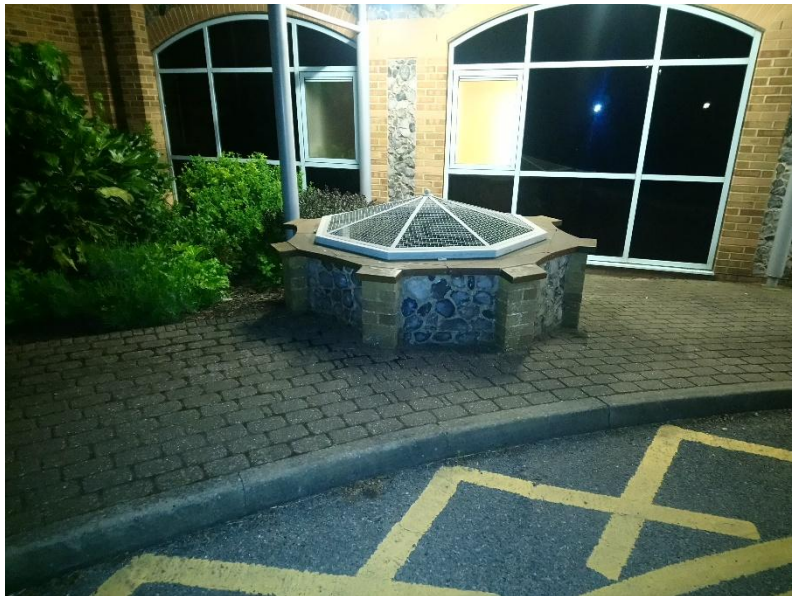
The Woodingdean Water Well, located just outside the Nuffield Hospital

In 1934, while building a sun terrace, a local resident uncovered something extraordinary—a human skeleton, buried in a flint “coffin.” Believed to date from the Bronze–Iron Age, the discovery captured local headlines and added a touch of ancient mystery to Woodingdean’s already colourful history.