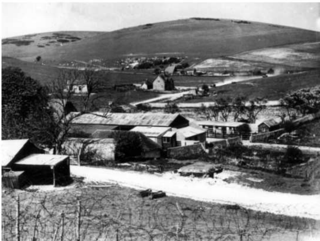
(Tanks move into Balsdean, shortly after May 1942.)