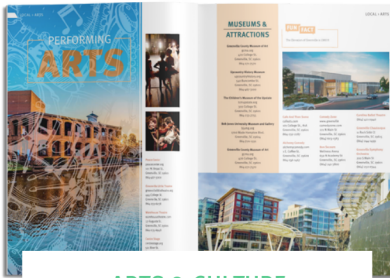
ARTS & CULTURE