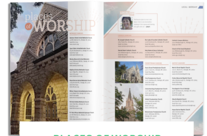
PLACES OF WORSHIP