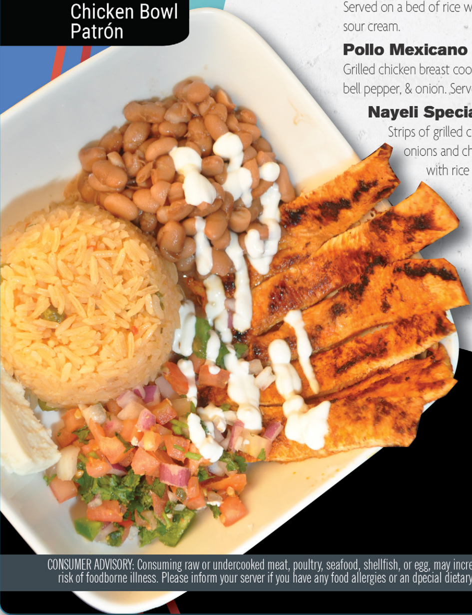
Chicken Bowl Patrón