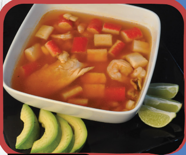
Caldo 7 Mares