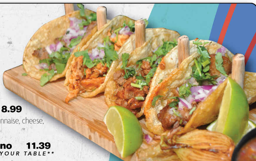
Mini Street Tacos