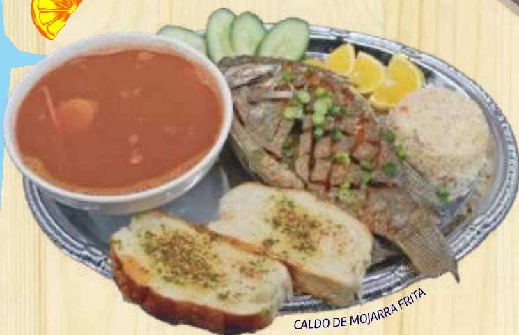
CALDO DE MOJARRA FRITA