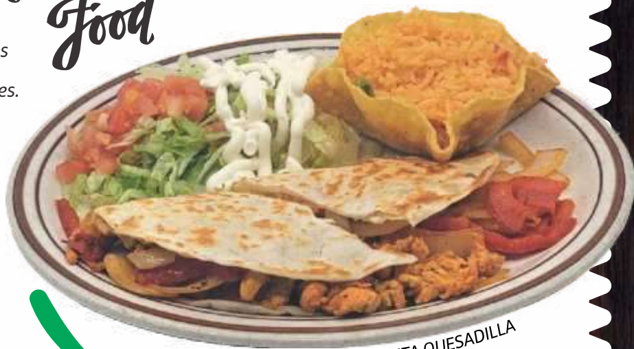
SUPER FAJITA QUESADILLA

Sautéed cactus, sautéed onions, steak, green salsa, cilantro, onions, sour cream, lettuce, tomato and cucumber.