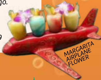
MARGARITA AIRPLANE FLOWER