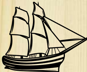
COCTEL DE CAMARONES

Mojarra soup, fried mojarra, rice, relish and orange.