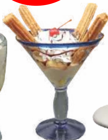
COPA DE NIEVE MIXTA.