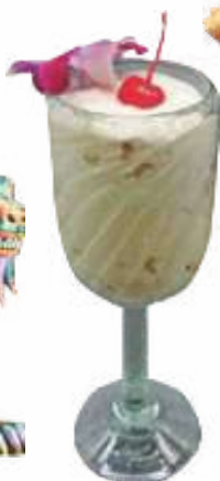
ARROZ CON LECHE.