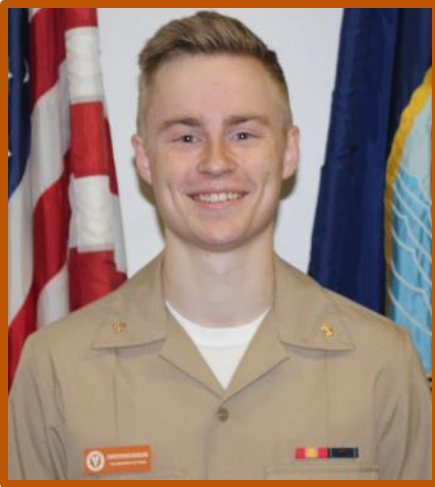
OC Bowling September 2020