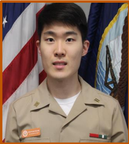
MIDN Kyoung November 2020