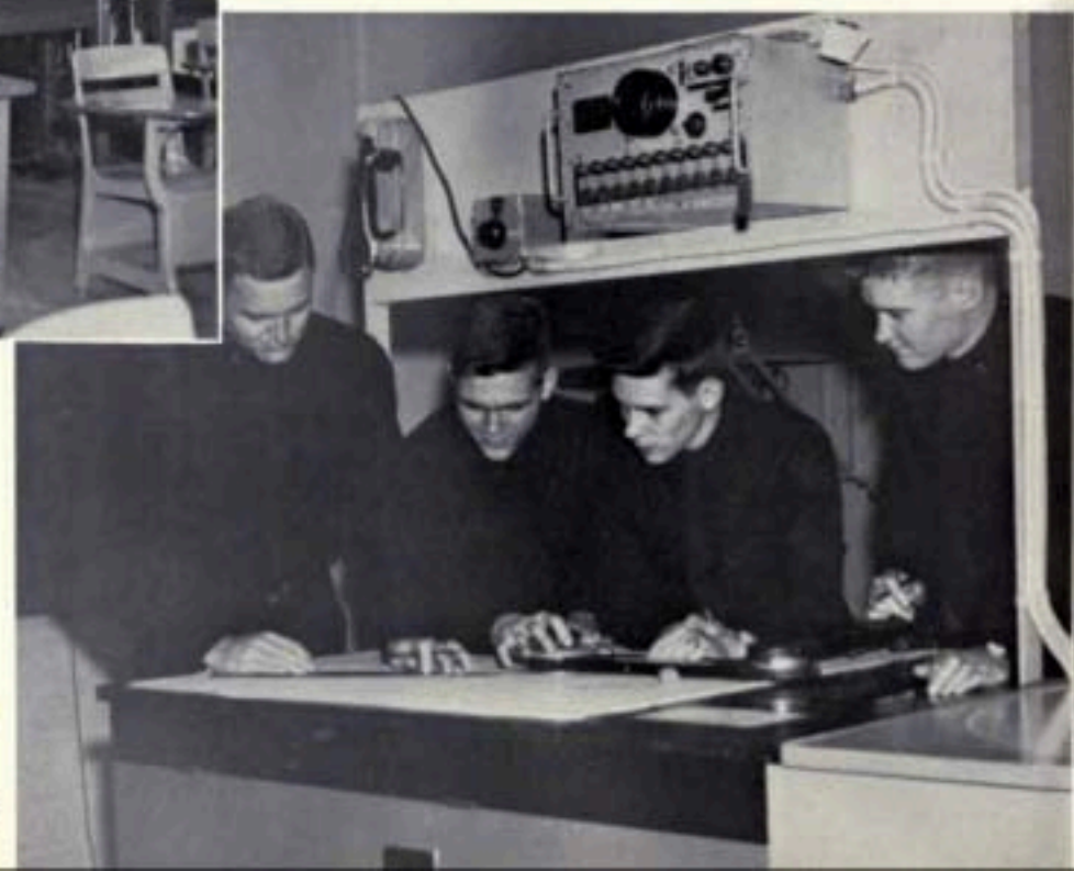
Plotting attack course in ship's combat information center.