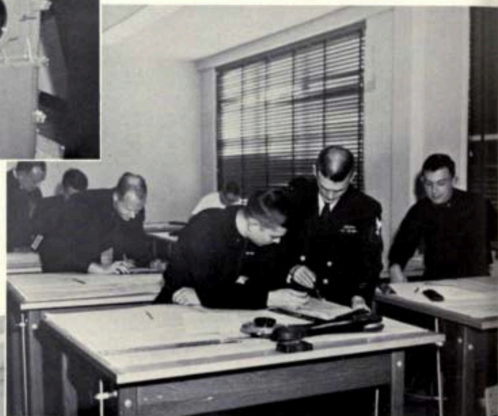
Navigating using Maneuvering Board.