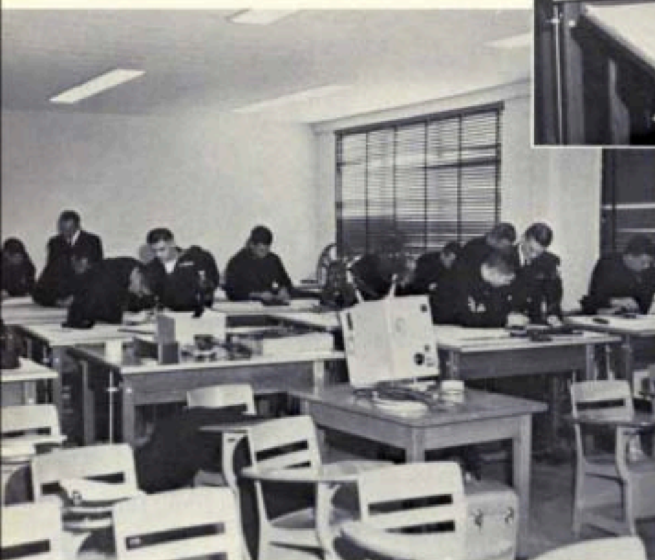
Plotting ship's course.