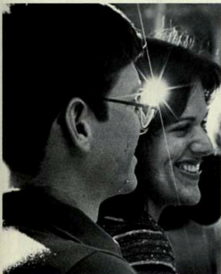
Beer calls and picnics provided a change of pace for NROTC members.