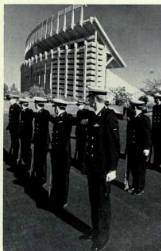
Midshipmen were inspected twice a semester.