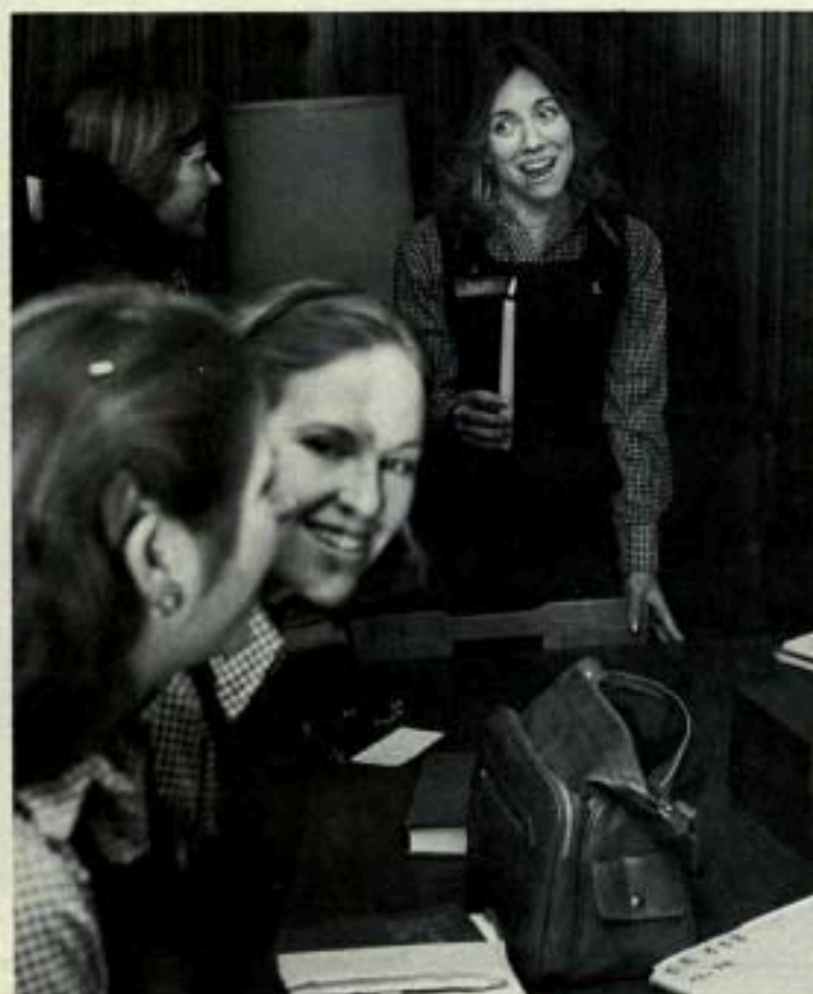
A "candle light" celebration marked the engagement of an Anchoress.