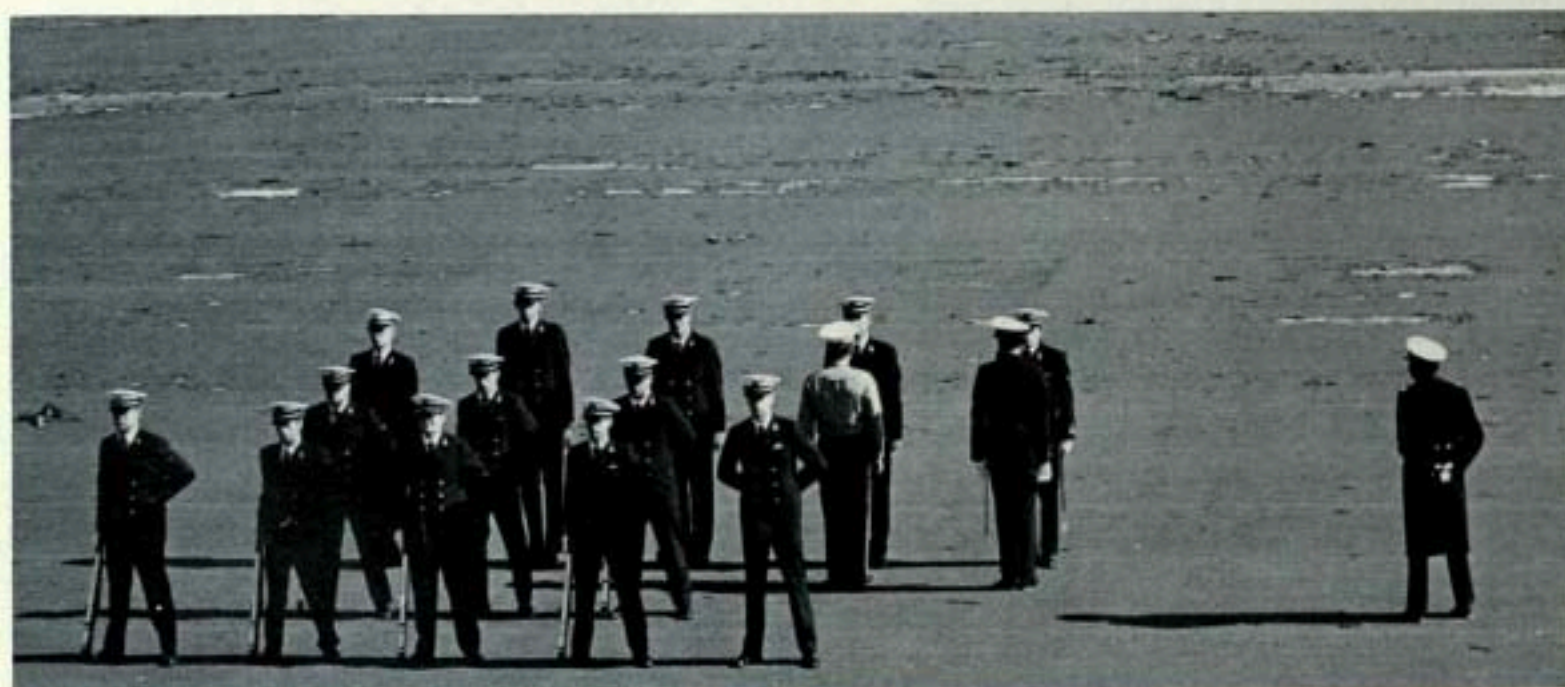
The Buccaneers, the oldest ROTC drill team in the United States, practiced year round for precision drill competition.