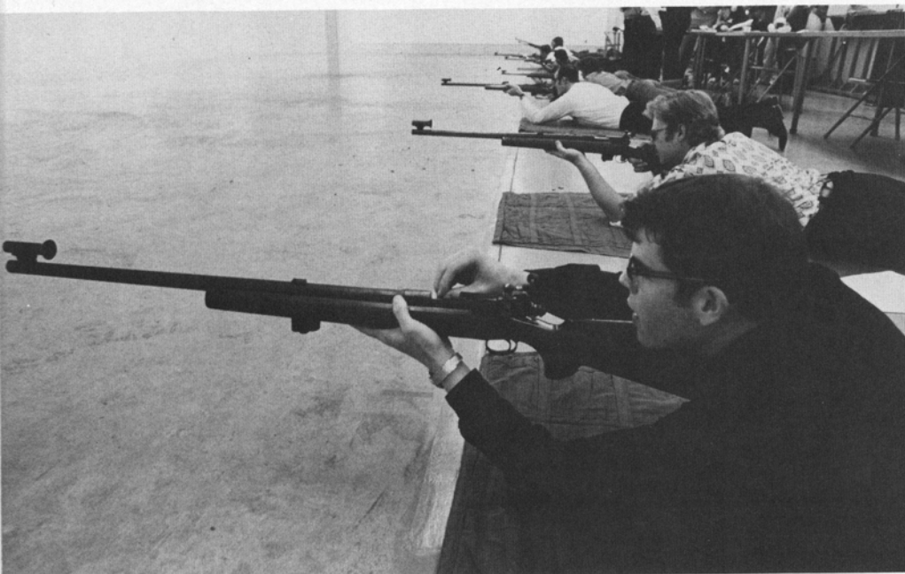
A holiday bird was awarded to winners of the Turkey Shoot.