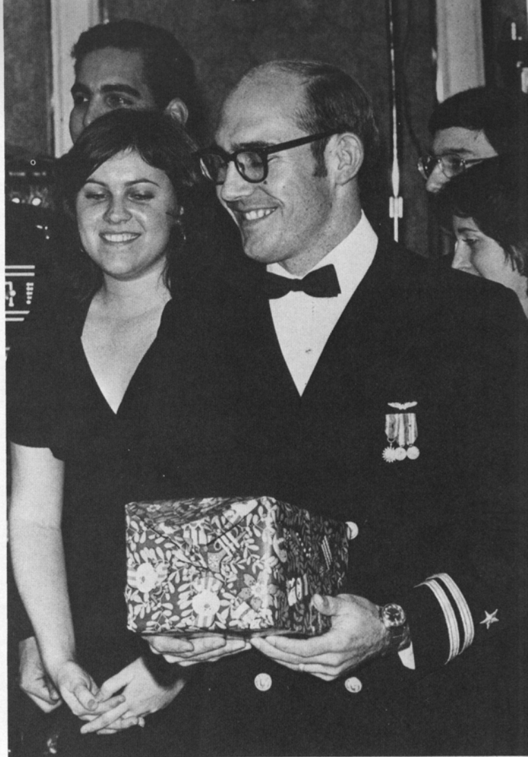
Gift giving and holiday spirit are a part of the Navy forma