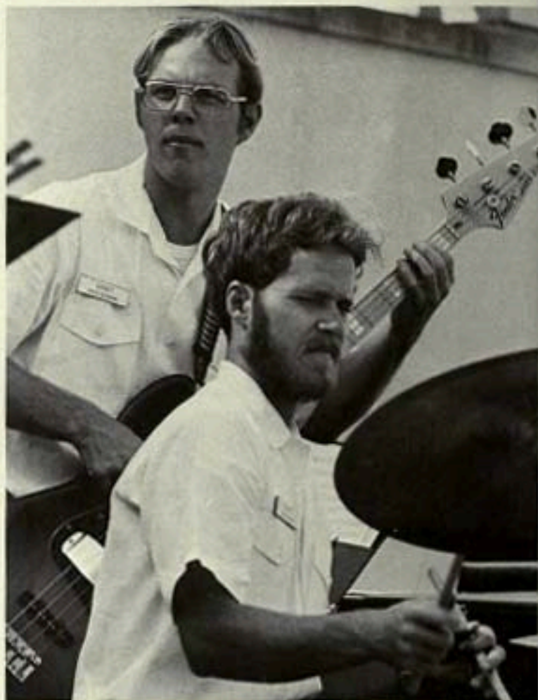
Spirit, a Navy jazz band, plays for the Navy birthday party.

The program continued its mission of training young men and women to fulfill the high responsibilities of command in active service.