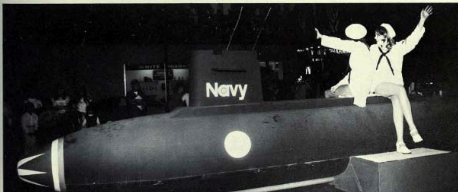
The Navy ROTC is one of several military organizations participating in the November Veterans Day Parade.