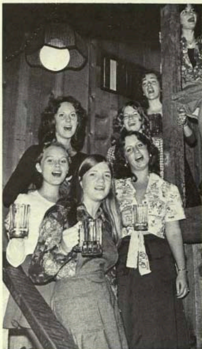
Anchorettes entertain midshipmen at Navy beer call.

A spring formal followed a banquet at which the year's outstanding Anchorettes were recognized.