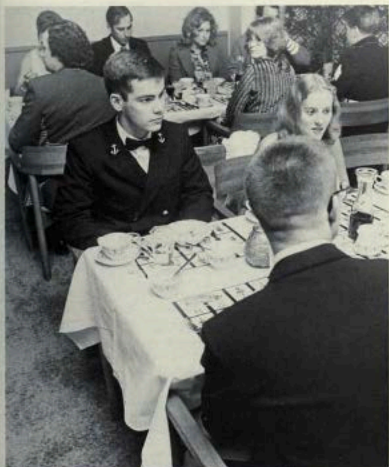
Midshipmen in their "dress blues" enjoy the dining-out festivities.