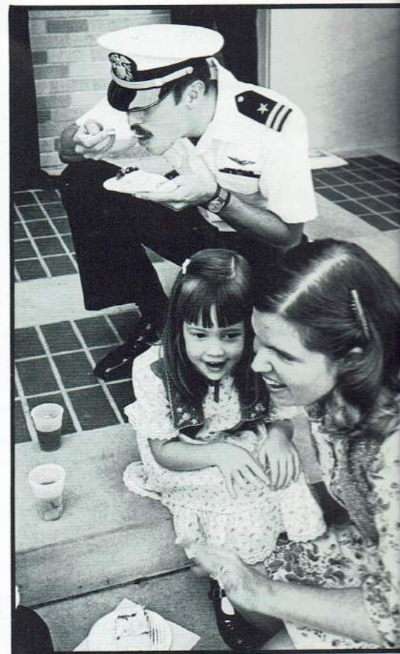
NROTC celebrates 203rd birthday.