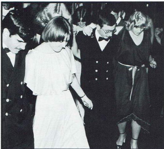
Navy men and dates "Cotton-Eyed Joe" at the Tri-Service Ball.