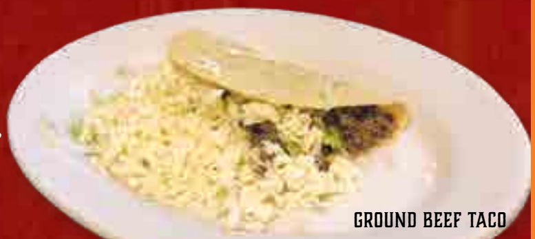
GROUND BEEF TACO