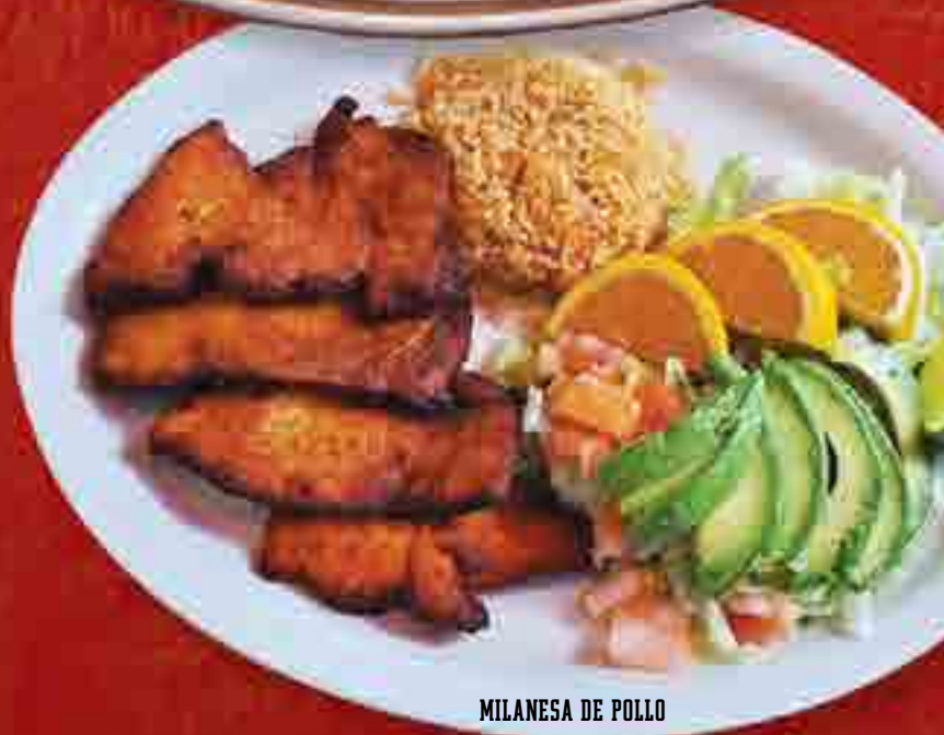
MILANESA DE POLLO