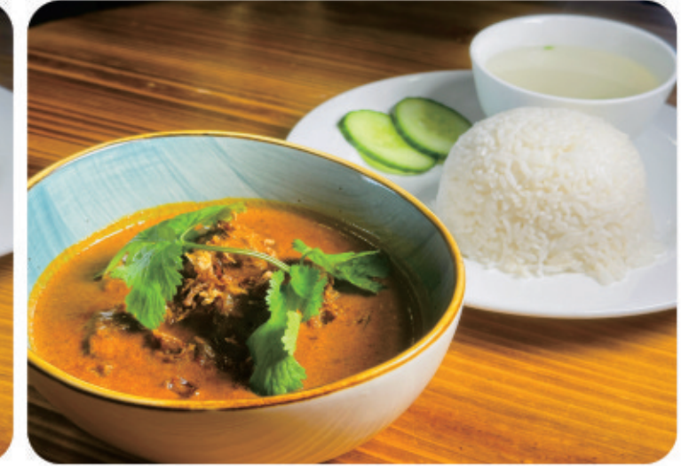
L08 | $25.00 Curry Lamb with Rice 咖喱羊饭