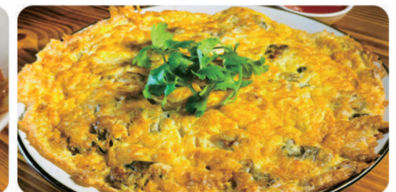
S17 | $32.00 Oyster Egg Omelette | 炸蚝饼 [Pan-fried egg omelette with oysters, onion]