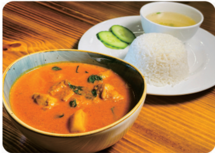
L03 | $21.00 Chicken Curry with Rice/Roti 咖喱鸡饭/薄饼