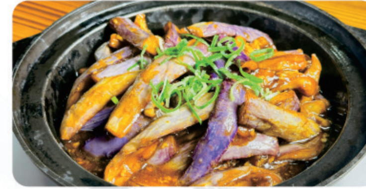
V04 | $33.00 Salted Fish Eggplant | 鱼香茄子煲 [Eggplant stir-fried with diced salted fish, garlic]