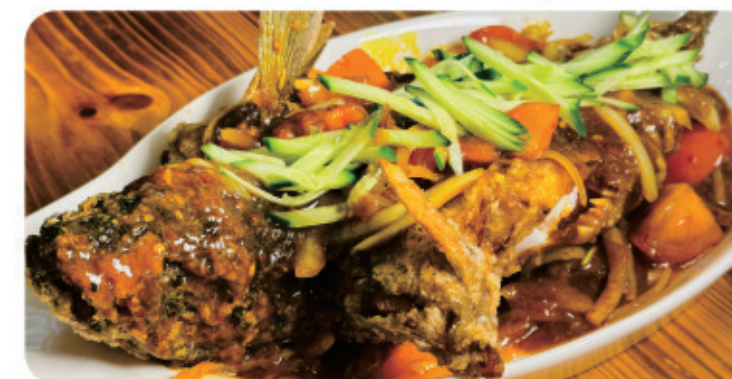
S15 | $Seasonal Price Whole Fish | 鱼(清蒸, 参巴, 亚森, 豆瓣酱) [Steam, Sambal sauce, Assam, soy chilli bean sauce, pick one of the four]