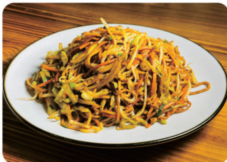
L16 | $22.00 Soya King Sauce Fried Noodles 豉油皇炒麵