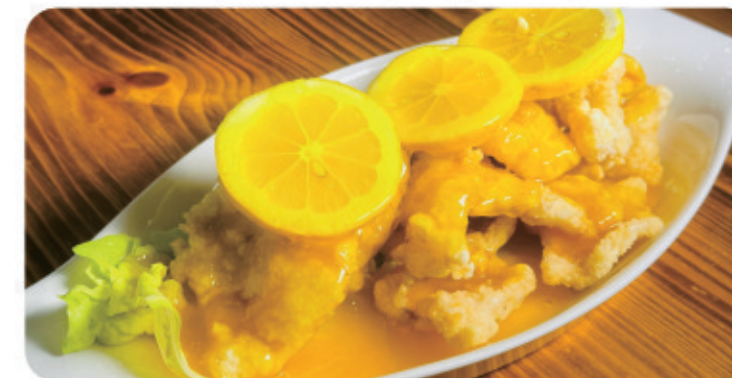
S13 | $44.80 Lemon Fish Fillet | 柠檬鱼片 [Deep-fried crumbed fish fillets, tossed with chef special lemon sauce]