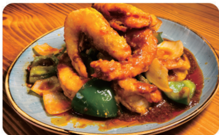
S03 | $44.80 Sambal Prawns(shell-on/shell-off) | 参巴虾 [Prawns, stir-fried with Malaysian sambal paste]