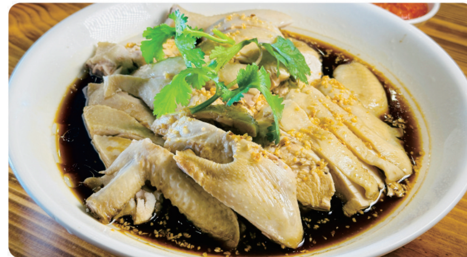
C01 Hainanese Chicken (half Chicken) 海南鸡 (半只) $28.00 [Poached 1/2 chicken, bone-in, served with chef special soy sauce]