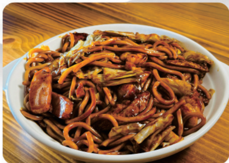
L17 | $23.00 Hokkien Mee 福建麵