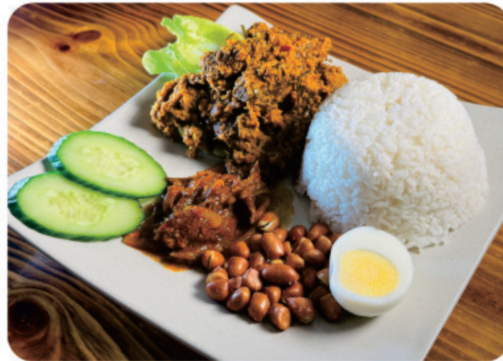
L04 | $22.00 Nasi Lemak with Chicken/Beef 椰浆鸡/牛饭