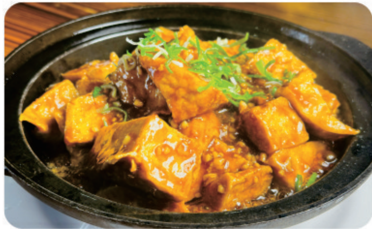
C11 | $31.00 Salted Fish Clay-pot Tofu | 咸鱼鸡粒豆腐煲 [Minced chicken cooked with tofu, salted fish, served in clay-pot]