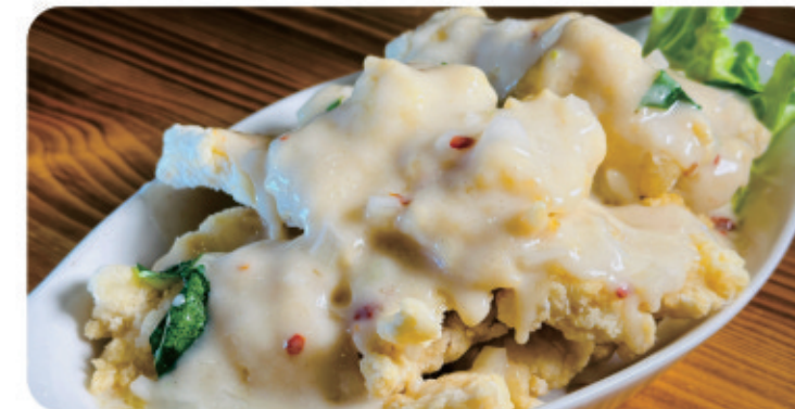
S09/S18 | $44.80 Butter Prawns/Fish Fillet | 奶油虾/鱼片 [seafood, crumbed, deep-fried, tossed with butter, fresh chilli, curry leaves]