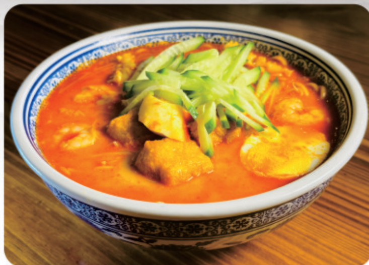
L19 | $22.00 Seafood Laksa (spicy) 海鲜喇吵(辣)