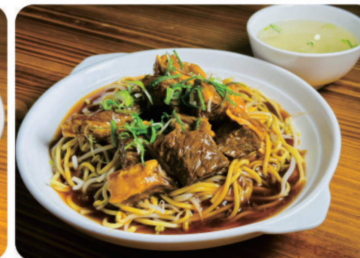
L23 | $22.00 Beef Brisket Noodles 干捞牛腩麵