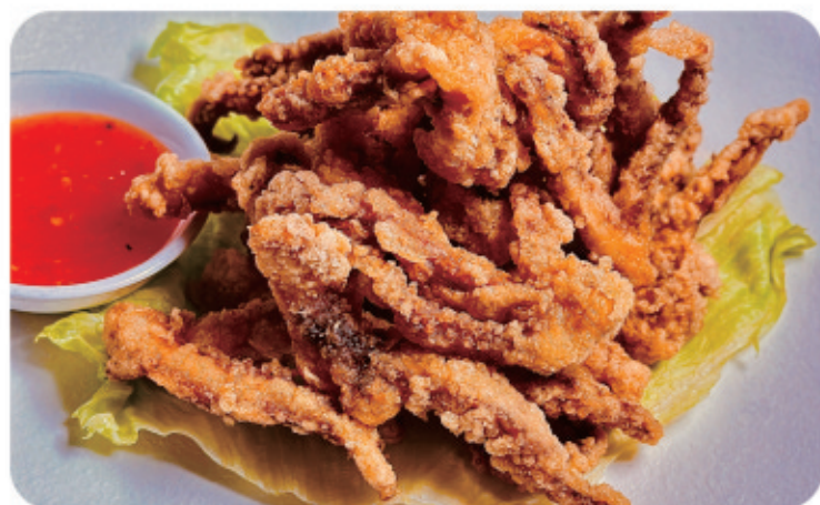
E05 | $15.00 Calamari Tentacles | 炸鱿鱼须