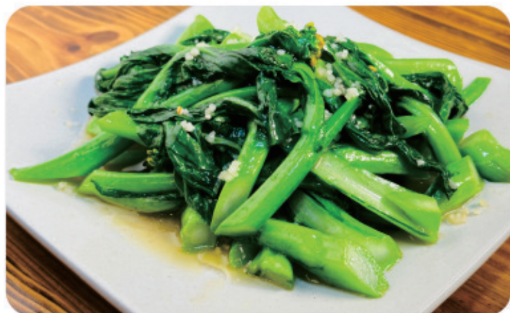
V02 | $28.00 Garlic Vegetables | 蒜蓉时菜 [Stir-fried seasonal vegetables with garlic]