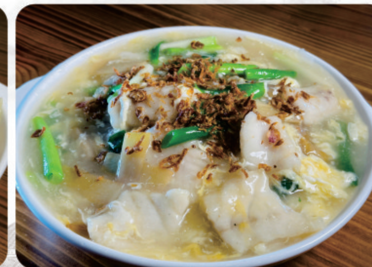
L25 | $23.00 Fillet Fish Wat Tan Hor 姜葱鱼片滑蛋河