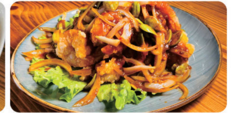
S08 | $44.80 Malaysian "Petai" Prawns | 参巴臭豆虾 [Seafood, stir-fried with "sator nuts" chilli paste]