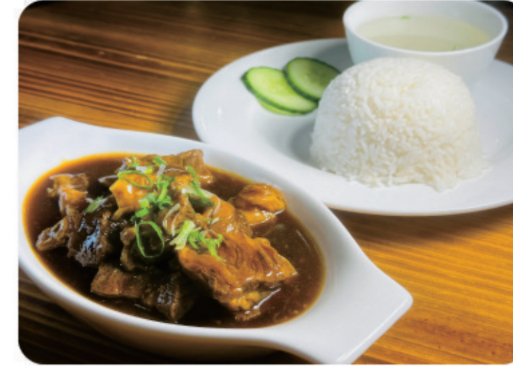
L07 | $22.00 Beef Brisket with Rice 牛腩饭/西红柿牛腩饭