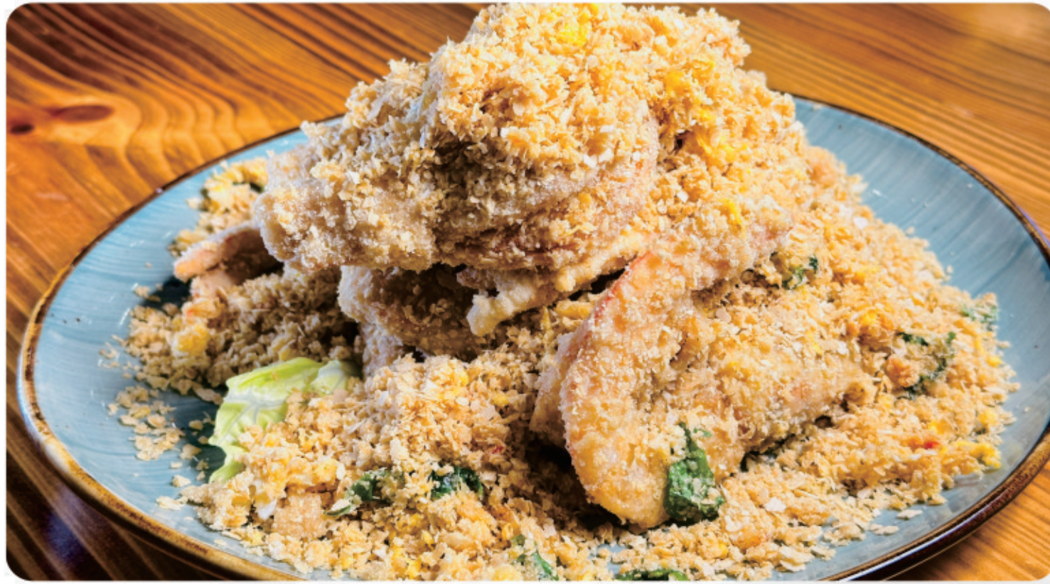
S06/S10 | $44.80 "Coconut Nestum" Prawns (shell-on/shell-off)/Squids | 椰汁麦片虾/鱿鱼 [Oat&egg breaded seafood with coconut, deep-fried till golden brown]