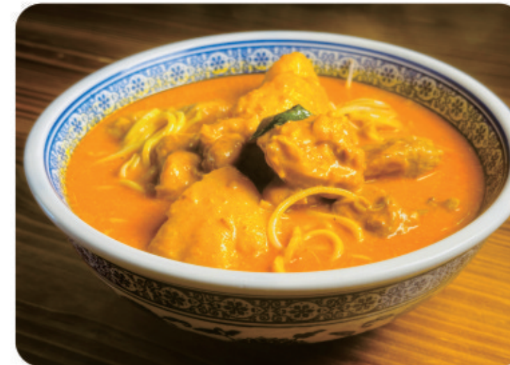
L20 | $22.00 Curry Chicken Noodles (spicy) 咖喱鸡麵(辣)