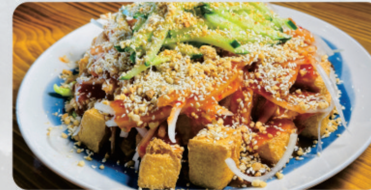
V06 | $28.00 Malaysian Fried Tofu | 马来炸豆腐 [Deep-fried tofu with cucumber, onion, chopped nuts, sesame seeds, sweet chilli sauce]