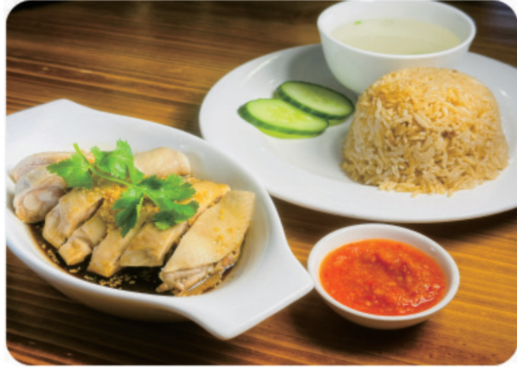
01 | $21.00 Hainanese Chicken Rice 海南鸡饭