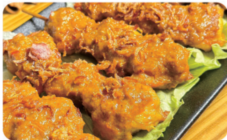
E01 | $17.50 Chicken Satay | 叻嗲鸡