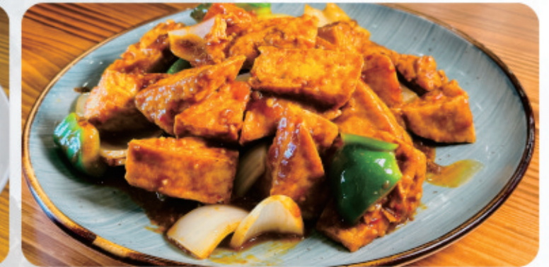
V07 | $28.00 Sambal Tofu | 马来参巴豆腐 [Deep-Fried tofu, fried with onion, capsicum, sambal sauce]