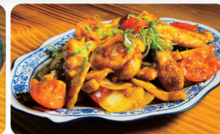
C05 | $33.50 "Nyonya" Chicken | 娘惹鸡 [Stir-fried chicken with Malaysian chilli paste, onion, pineapple, tomatoes]