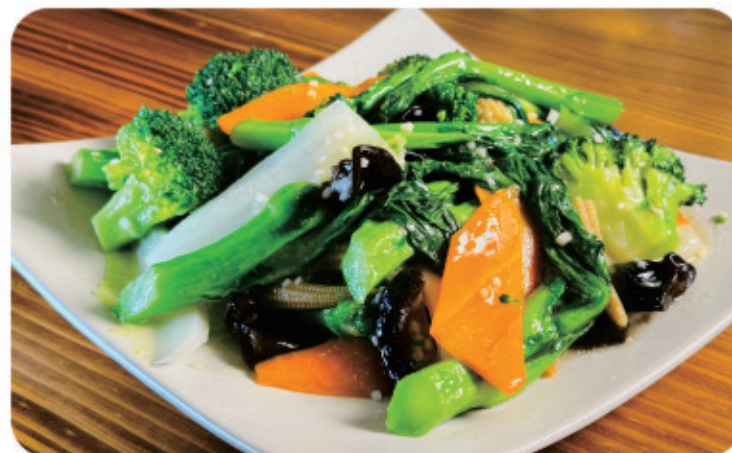
V03 | $28.00 Mixed Vegetables | 什锦时菜 [Stir-fried Mixed vegetables with garlic, oyster sauce]