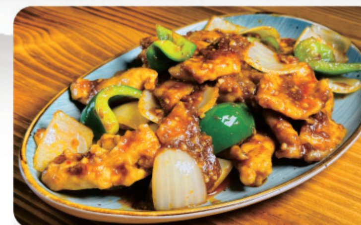
C04 | $33.50 Malaysian Sambal Chicken | 参巴鸡 [Stir-fried chicken with Malaysian sambal paste, onion, capsicum]