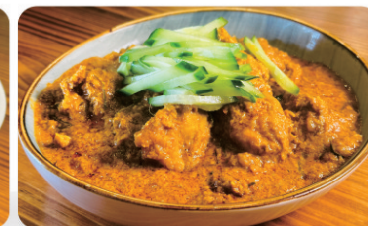
C03 | $35.00 Chicken Rendang | 仁当鸡 [Chicken cooked in Malaysian spices, lemongrass, coconut]