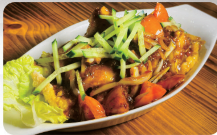
S02/S12 | $44.80 "Assam" Prawns/Fish Fillet | 亚森虾/鱼片 [Seafood, Stir-fried with tangy tamarind chilli paste]