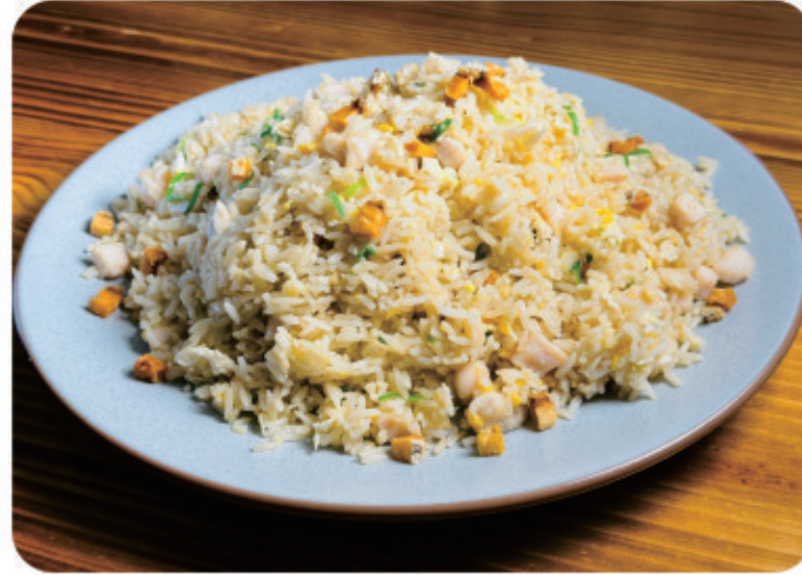
L02 | $22.00 Salted Fish with Chicken Fried Rice 咸鱼鸡粒炒饭