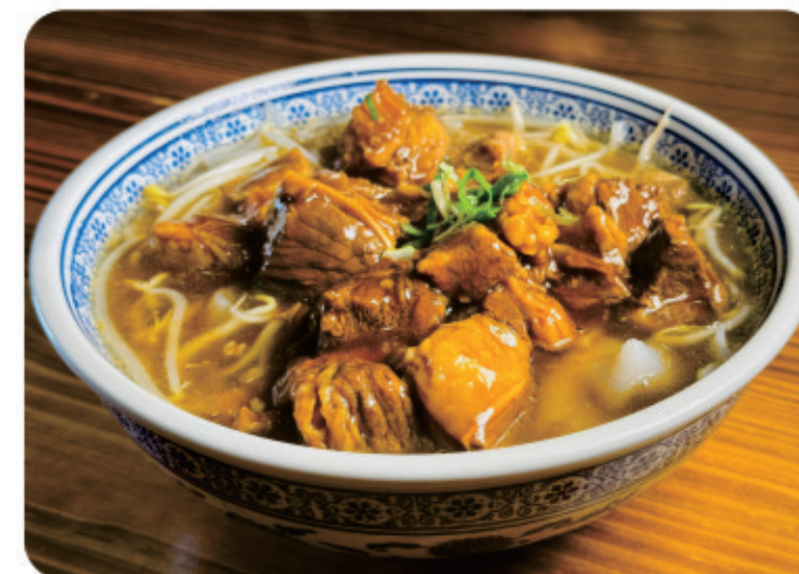
L22 | $22.00 Beef Brisket Rice Noodles Soup 清汤牛腩河粉/麵/米粉