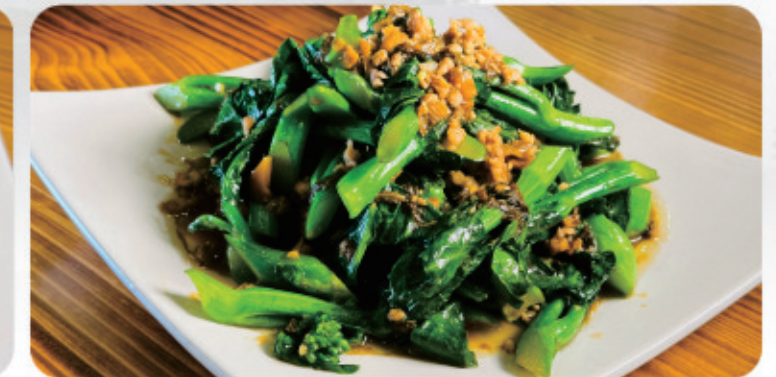
V09 | $28.50 Stir Fried "Kai Lan" | 梅菜肉松芥蓝 [Chicken minced stir-fried with "Kai Lan", preserved vegetable]