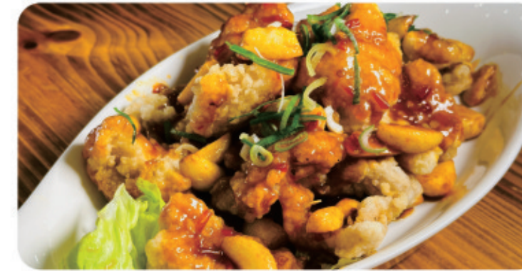
S20 | $44.80 Spicy Sauce Fish Fillet | 豆瓣酱鱼片 [Fish fillet braised with ground bean paste sauce]