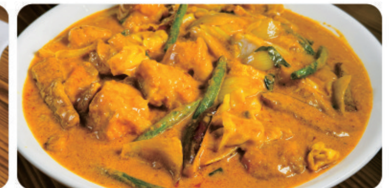
S14 | $48.00 Malaysian Fish Curry | 马来咖喱鱼 [Malaysian style curry fish, eggplant, beans, tomatoes]