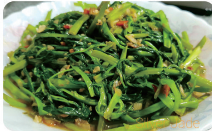
V01 | $28.00 Sambal Vegetable (Seasonal) | 马来风光 [vegetable stir-fried with Malaysian sambal paste]