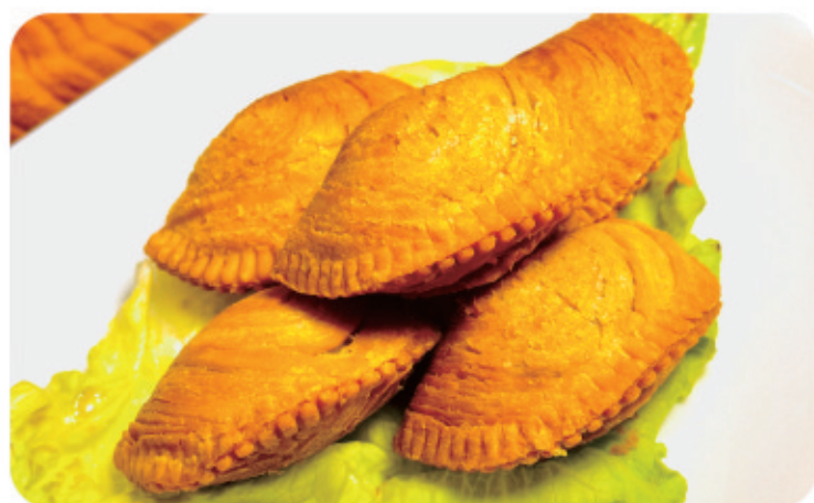
E03 | $9.80 Vegetarian Curry Puff | 咖喱角