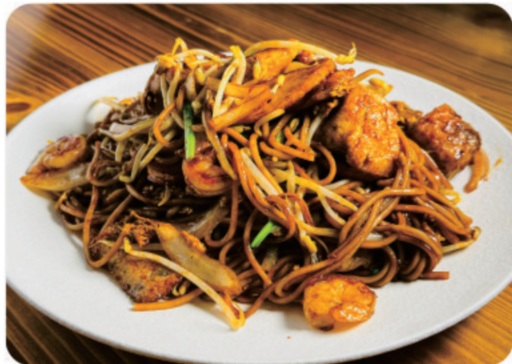
L13 | $22.00 Mee Goreng (spicy) 马来炒麵