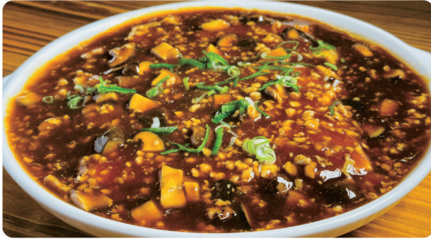
C10 | $28.00 Minced Chicken Tofu | 鸡肉碎豆腐 [Minced chicken cooked with tofu]