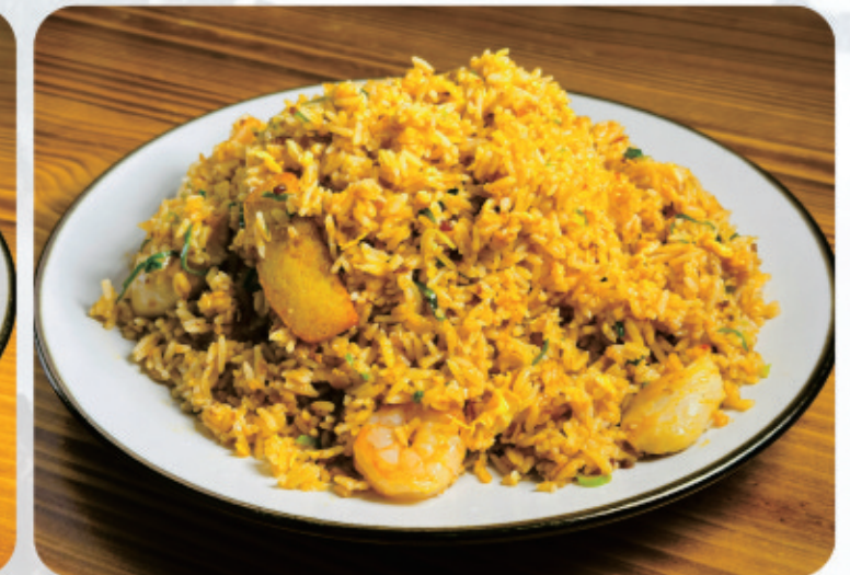
L12 | $22.00 Nasi Goreng Fried Rice/ Vermicelli (spicy) 马来炒饭/米粉(辣)