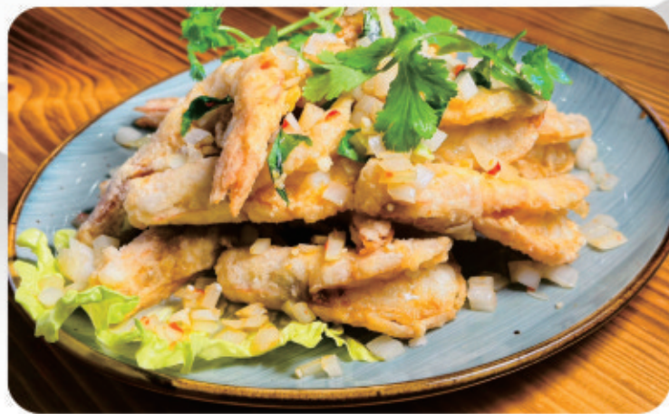
S01/S11 | $44.80 Salt & Pepper Prawns/Squids | 椒盐虾/鱿鱼 [Deep-fried seafood, tossed with mixed pepper salt, diced onion]