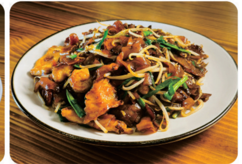
L10 | $22.00 Char Kuey Teow 炒粿条