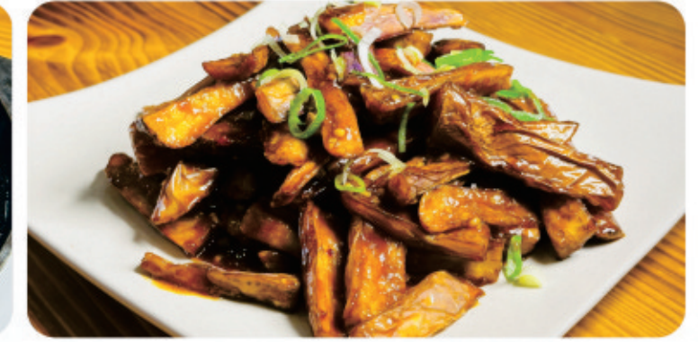
V05 | $31.00 Sambal Eggplant | 马来参巴茄子 [Eggplant stir-fried with sambal paste]