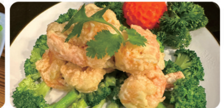
S21 | $44.80 "Wasabi" Prawns(shell-off) | 芥末虾 [Prawns(shell-off), Stir-fried with Wasabi sauce]