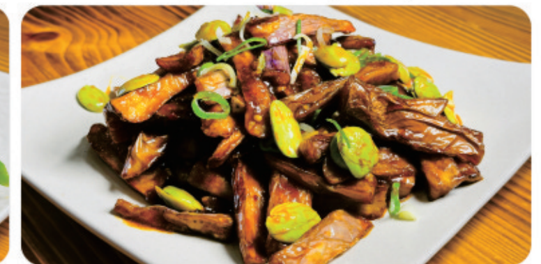
V12 | $33.00 Sambal "Petai" Eggplant | 参巴臭豆腐茄子 [Stri-fried eggplant with petai, sambal, garlic]