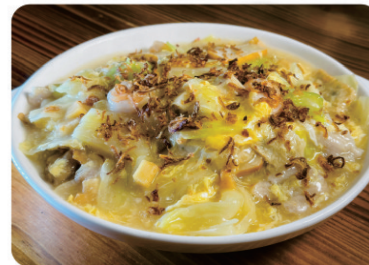
L24 | $23.00 Wat Tan Hor 滑蛋河