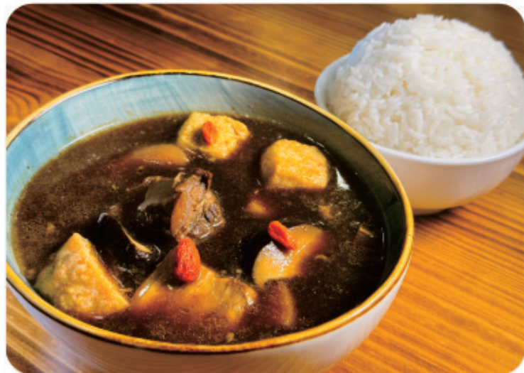
L05 | $25.00 Bak Kut Teh Herbal Pork Soup 肉骨茶饭