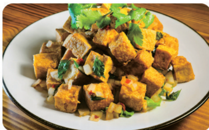
E04 | $26.00 Salt & Pepper Tofu Cubes | 椒盐豆腐