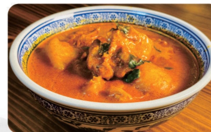
C02 | $33.50 Chicken Curry | 咖喱鸡 [Malaysian style chicken curry]