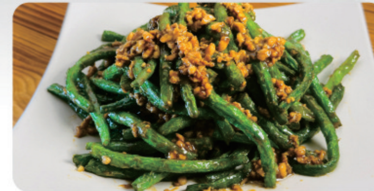
V08 | $31.00 Four Season Bean (spicy/not) | 肉松四季豆 [Chicken minced stir-fried, four season beans]