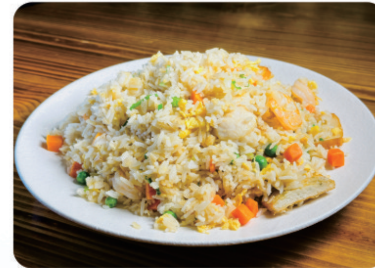
L09 | $22.00 Combination Fried Rice 什锦炒饭