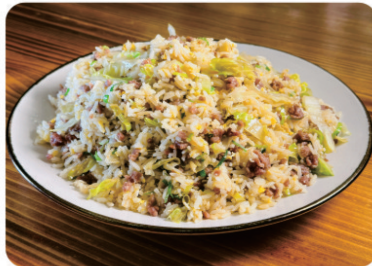
L06 | $22.00 Beef Fried Rice 牛肉炒饭