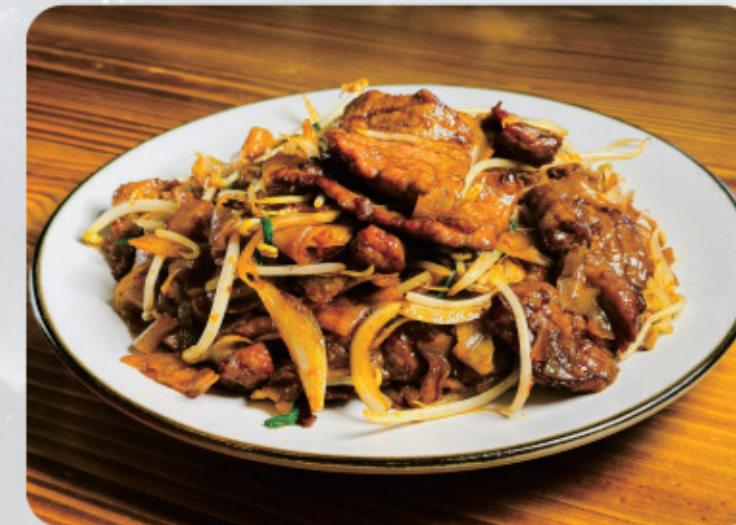
L11 | $22.00 Stir Fried Sambal Beef with Rice Noodles(spicy) 参巴牛肉炒粿条(辣)