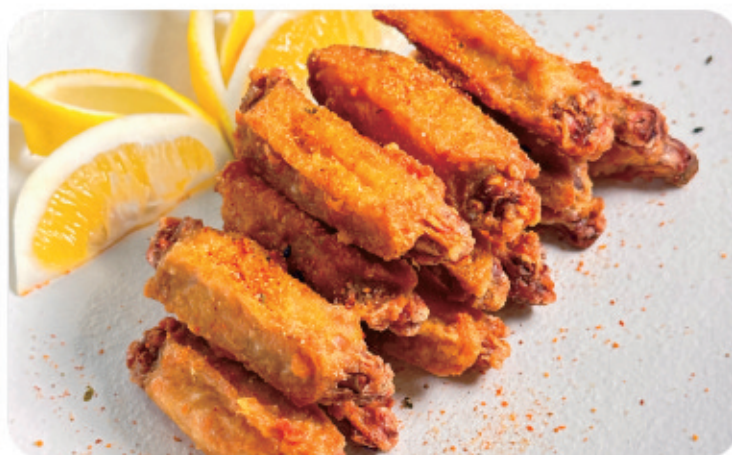
E06 | $13.00 Chicken Wings (Spicy/No spicy) | 炸鸡翅