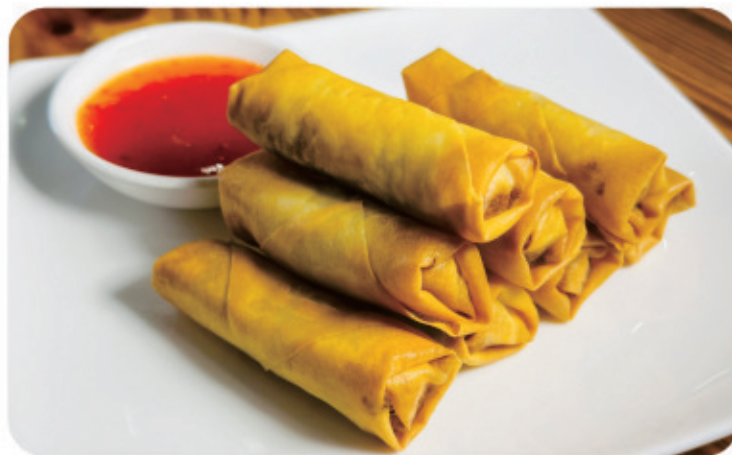
E02 | $9.80 Vegetarian Spring Roll | 素菜春卷