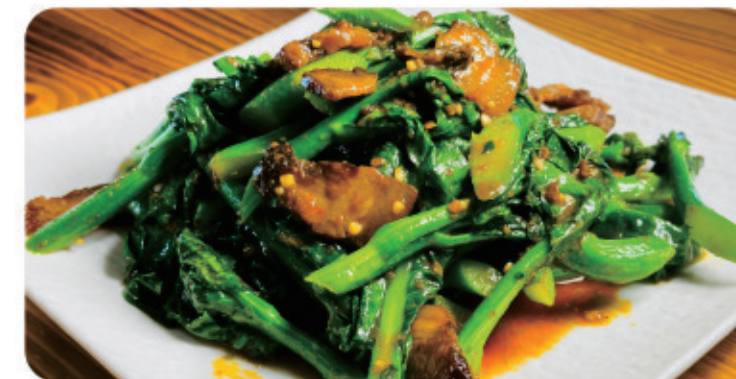
V10 | $28.50 Sambal "Kai Lan" | 参巴腊肉芥蓝 [Stir-fried "Kai Lan" with sambal, preserved pork]