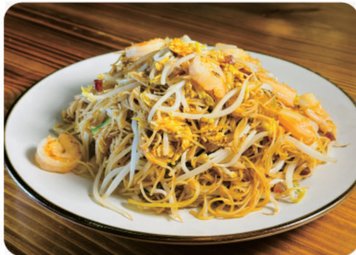
L14 | $22.00 Singapore Fried Vermicelli 星洲炒米粉