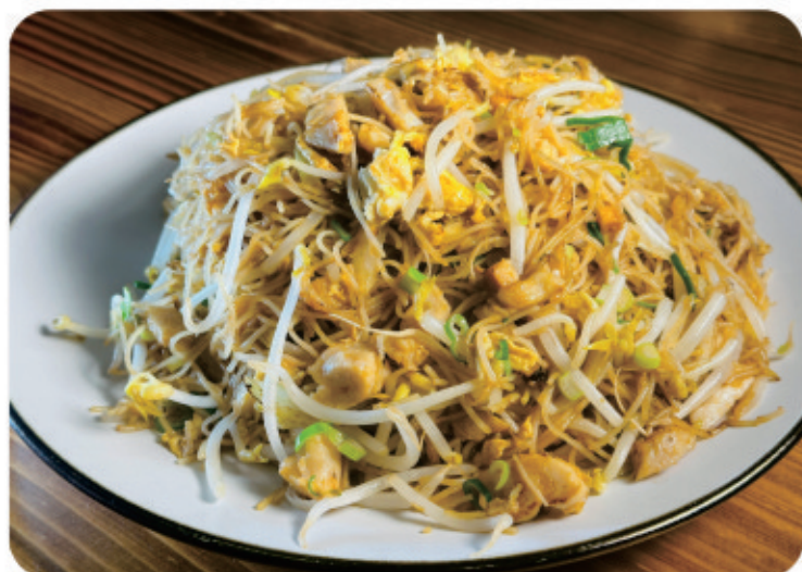
L15 | $22.00 Salted Fish with Chicken Fried Vermicelli 咸鱼鸡粒炒米粉