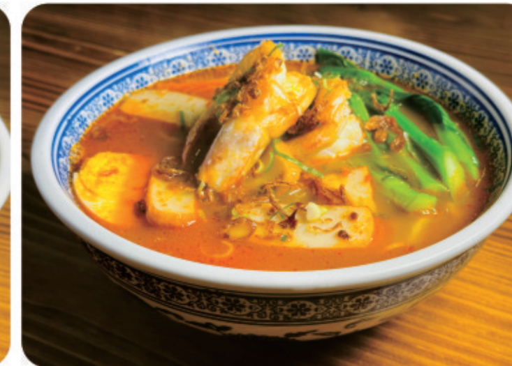
L21 | $23.00 Prawn Soup Noodle (spicy) 虾麵(辣)