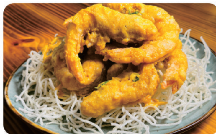
S04 | $44.80 Fried Prawns with Salted Egg Yolk | 黄金虾 [Deep-fried crumbed prawns tossed with "salted egg yolk"]