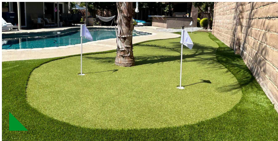
EAGLE GREEN W/ PAD