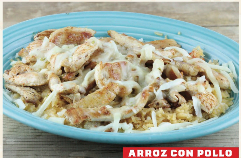
ARROZ CON POLLO