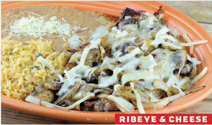
RIBEYE & CHEESE