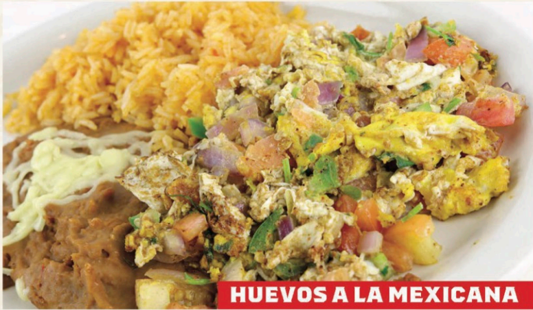
HUEVOS A LA MEXICANA