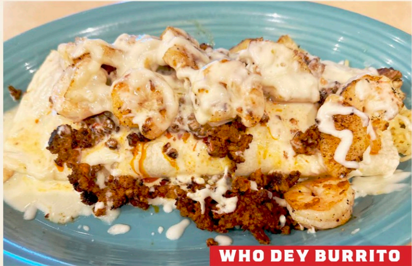
WHO DEY BURRITO

Grilled chicken cooked with onions and mushrooms. Covered with cheese sauce and served with rice and tortillas. 13.99