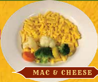
MAC & CHEESE