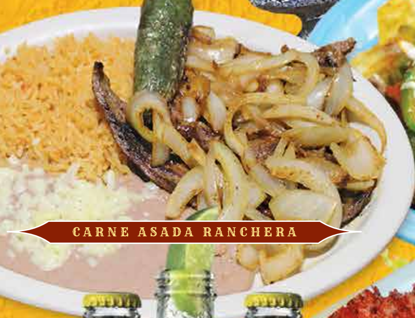
CARNE ASADA RANCHERA