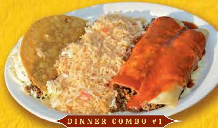
DINNER COMBO #1