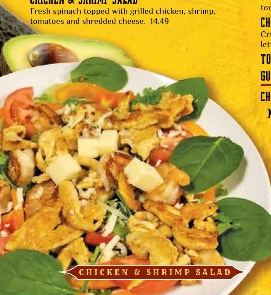
CHICKEN & SHRIMP SALAD

Fresh spinach topped with grilled chicken, shrimp, tomatoes and shredded cheese. 14.49