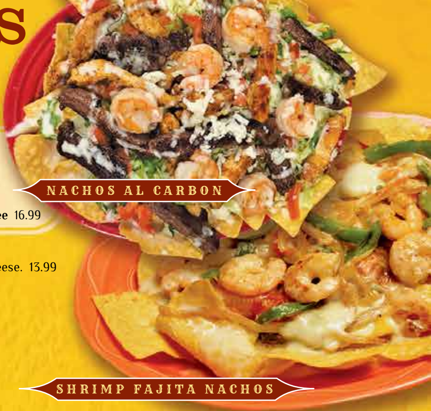
NACHOS AL CARBON