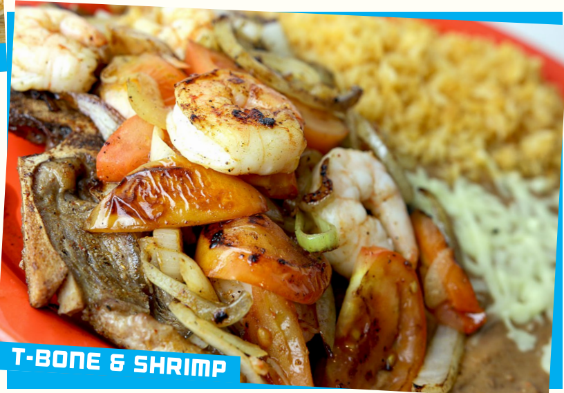
T-BONE & SHRIMP

An 8oz ribeye served with French fries and grilled veggies. 12.99