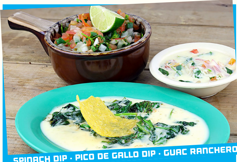
SPINACH DIP • PICO DE GALLO DIP • GUAC RANCHERO

Fresh cubed avocado, pico de gallo and lime. 4.75