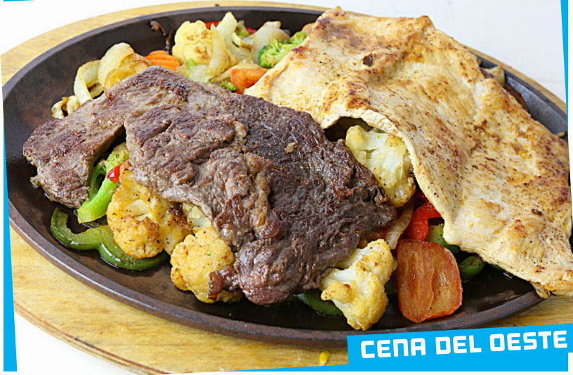
CENA DEL OESTE