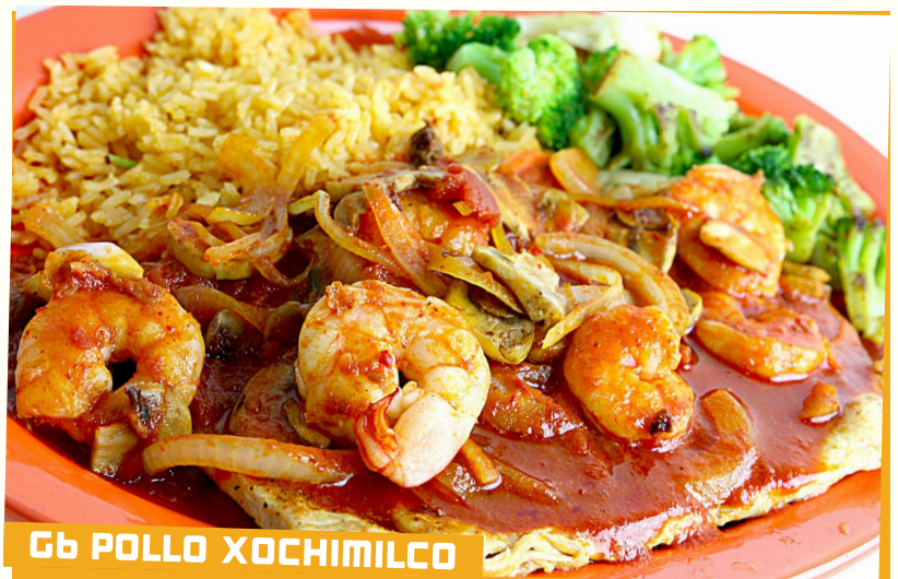
G6 POLLO XOCHIMILCO

Grilled tilapia and shrimp. Served with rice, carrots, cauliflower, broccoli and zucchini. 14.50