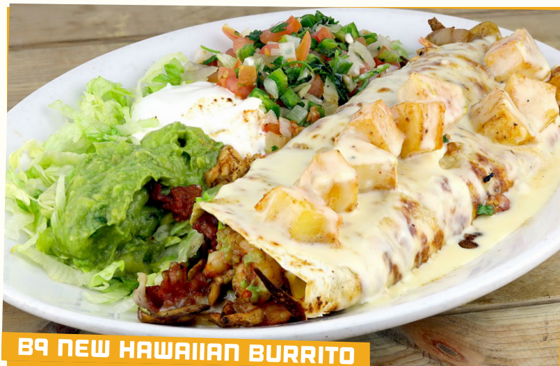
B9 NEW HAWAIIAN BURRITO

Grilled chicken or steak fajitas stuffed in a 10" burrito with beans, bell peppers, onions and tomatoes. Served with lettuce, sour cream, pico de gallo and guacamole. 11.99