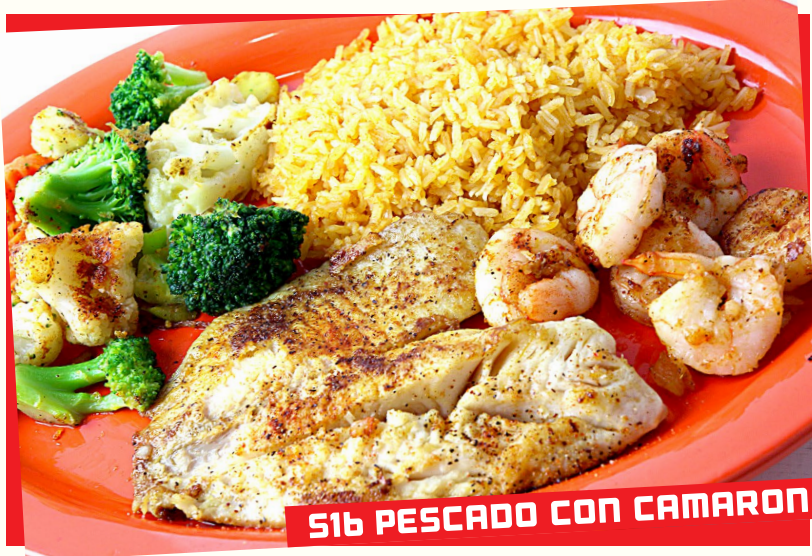
S16 PESCADO CON CAMARON