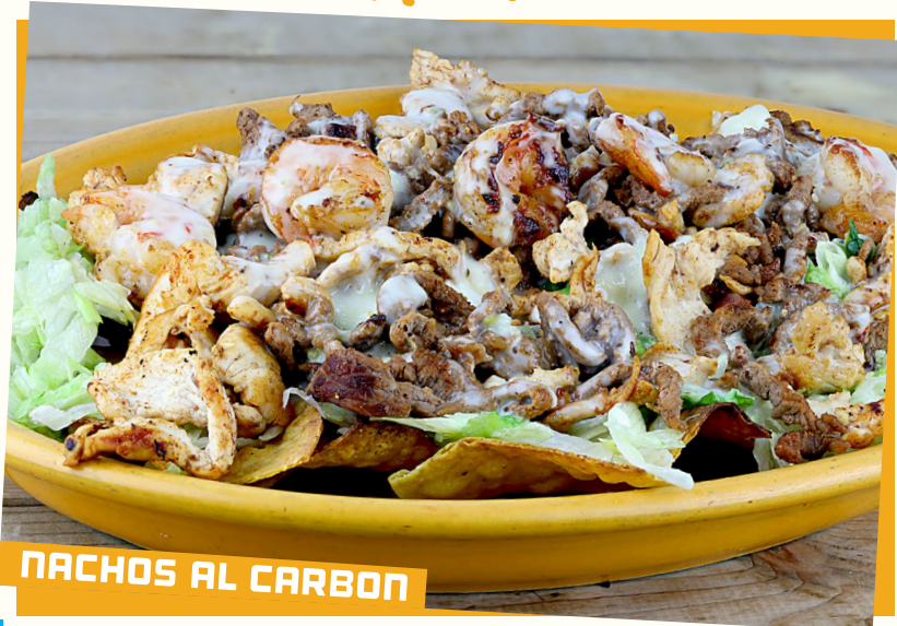
NACHOS AL CARBON