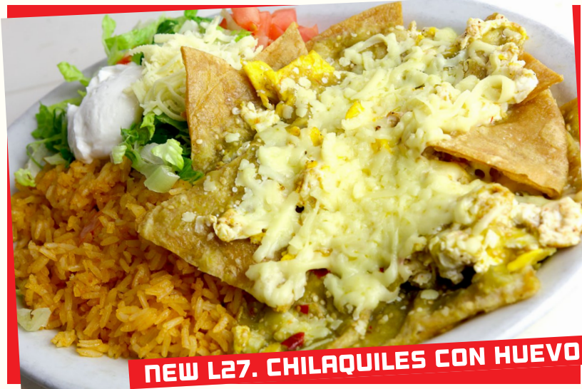
NEW L27. CHILAQUILES CON HUEVO

SERVED MONDAY-FRIDAY 11AM - 2:30PM, SATURDAY 11:30AM - 3PM