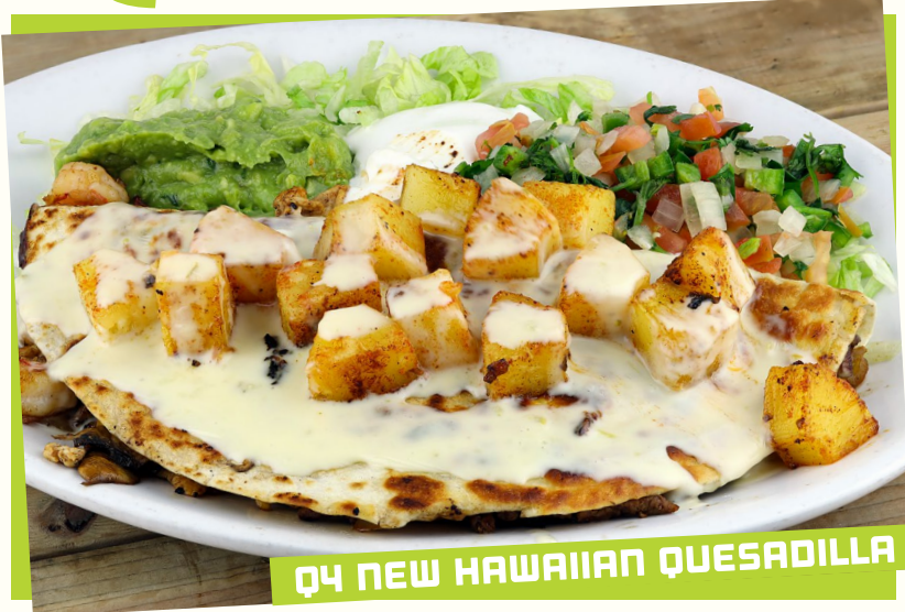
Q4 NEW HAWAIIAN QUESADILLA