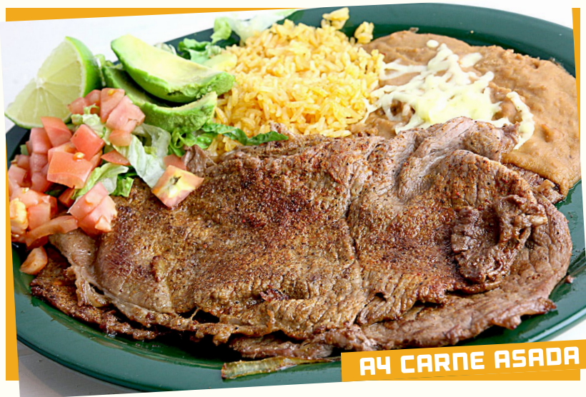
A4 CARNE ASADA

Thin-sliced chicken or steak, lightly breaded. Served with rice, guacamole, lettuce, tomatoes and tortillas. 11.50