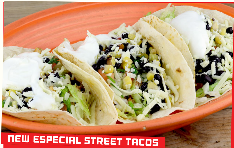
NEW ESPECIAL STREET TACOS

Tacos are topped with onions and cilantro.