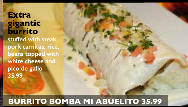
BURRITO BOMBA MI ABUELITO 35.99

stuffed with steak, pork carnitas, rice, beans topped with white cheese and pico de gallo 35.99