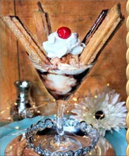
CHURROS CON NIEVE

Vodka, Baileys, Hershey's Syrup, whipped cream and a cherry 9.99