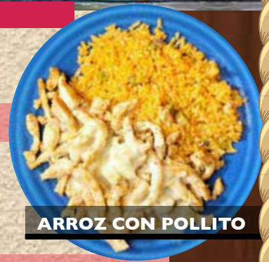
ARROZ CON POLLITO