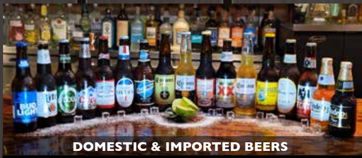
DOMESTIC & IMPORTED BEERS