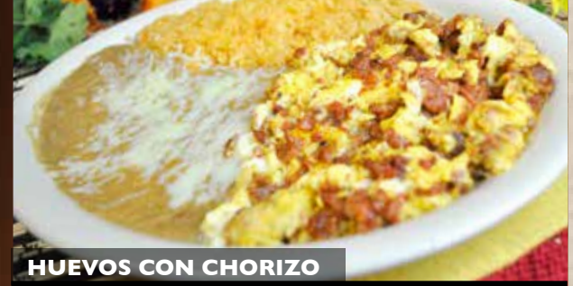
HUEVOS CON CHORIZO