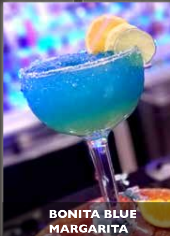
BONITA BLUE MARGARITA