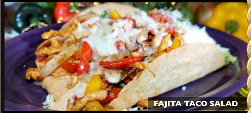
FAJITA TACO SALAD