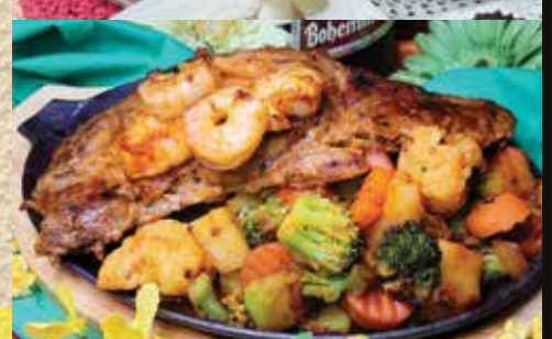
CALIFORNIA STEAK & SHRIMP