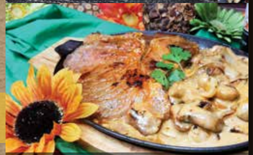
T-BONE STEAK MI ABUELITO