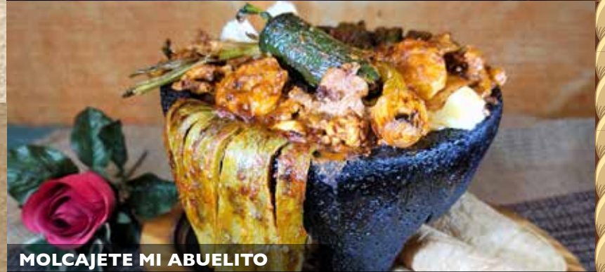
MOLCAJETE MI ABUELITO