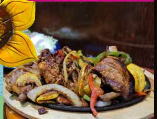
COSTILLAS CON ZUCCHINI

Shrimp, onions and mushrooms, marinated with chipotle sauce, served with rice, beans and tortillas 18.99