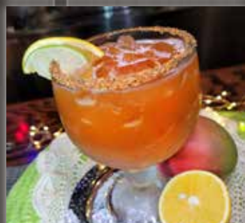
LA COQUETA MARGARITA