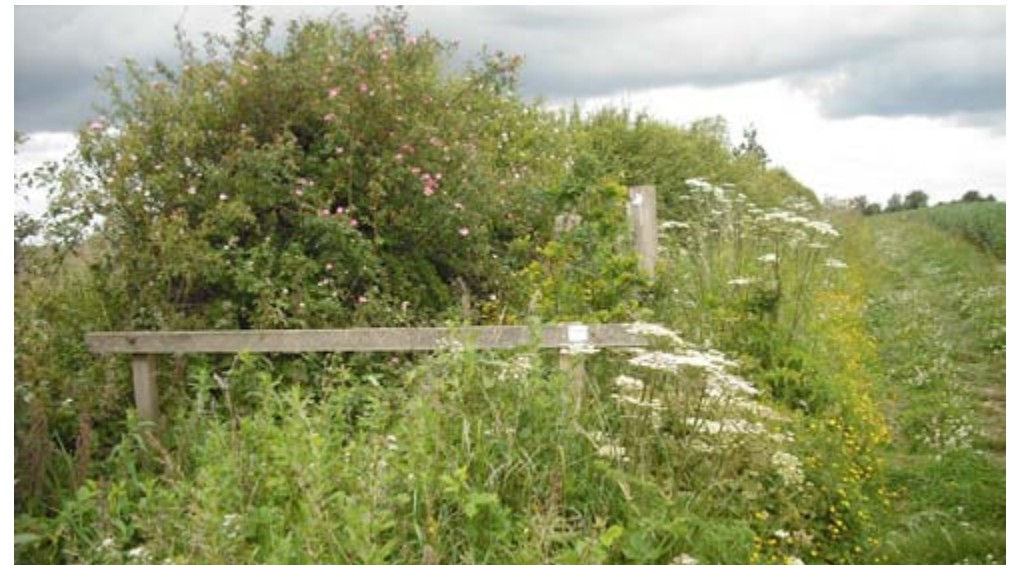
Hedgerows and margins across farmland provide habitat for wildlife and intercept surface water run-off. Hedges and hedgerow trees also contribute to sense of place.