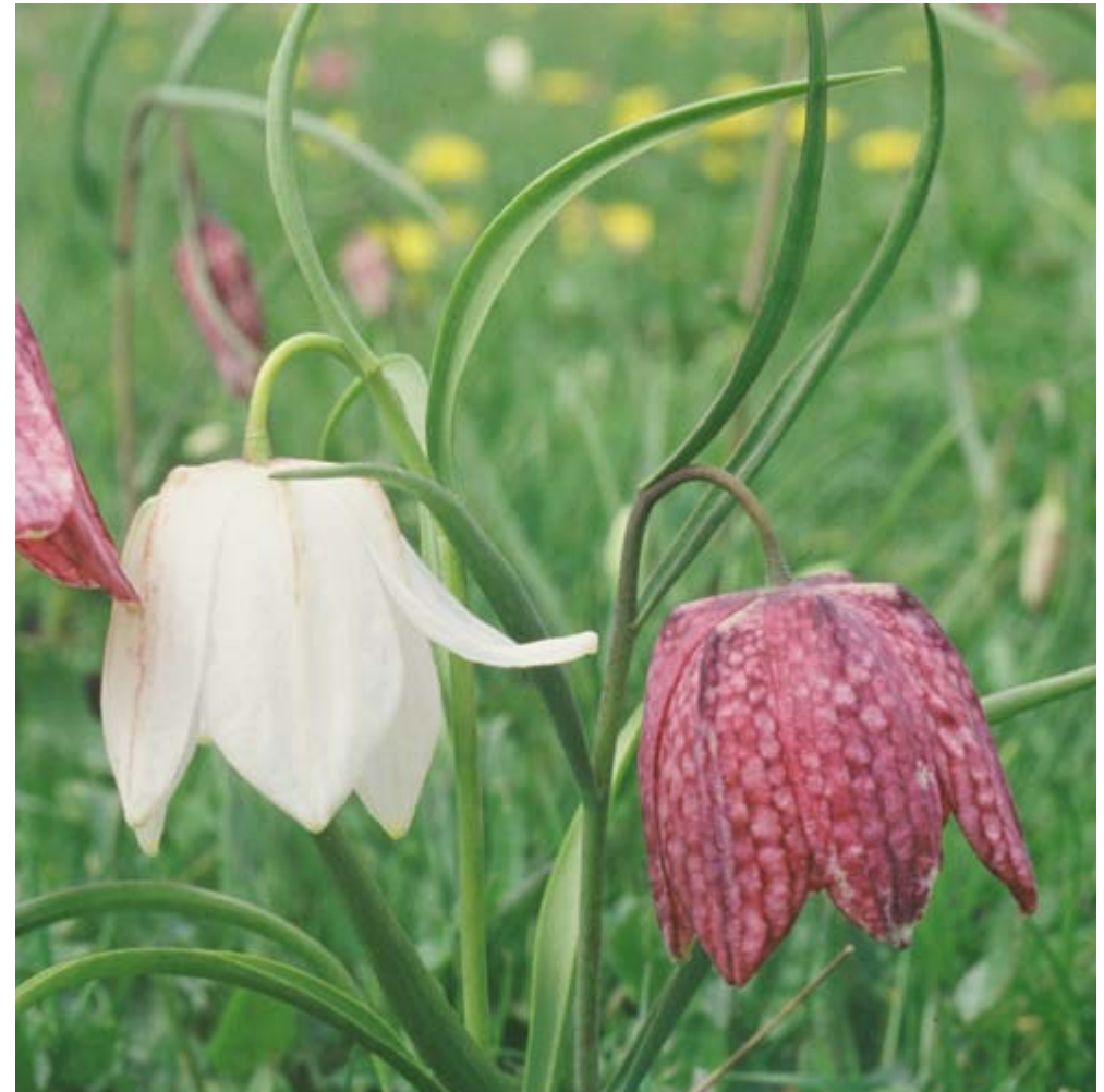
Snake's head fritillary grows in the historic meadows of North Meadow and Clattinger Farm SAC. Other characteristic species include brown hare, native black poplar and brown hairstreak butterfly.

Although the NCA retains many tranquil spaces, the overwhelming impression is of an area criss-crossed by transport routes including motorways, major roads, canals and railway lines, dominated by Didcot Power Station and industrial activities around Abingdon in the south and Oxford Airport in the north, with the large towns of Swindon and Aylesbury to the west and east. Activity from military airbases such as Fairford and Brize Norton outside the NCA also impacts on the tranquillity of the area.