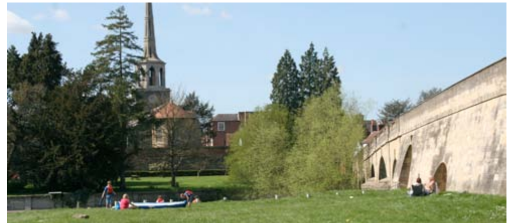
Historic settlements are located at river crossings, such as at Wallingford on the Thames. People today enjoy riverside green spaces and the Thames Path National Trail.

Source: Upper Thames Countryside Character Area description; Countryside Quality Counts (2003), Draft Historic Profile