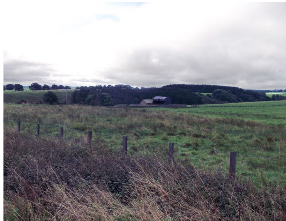
The western part of Mid Northumberland is characterised by undulating pastures, trees and farm buildings.