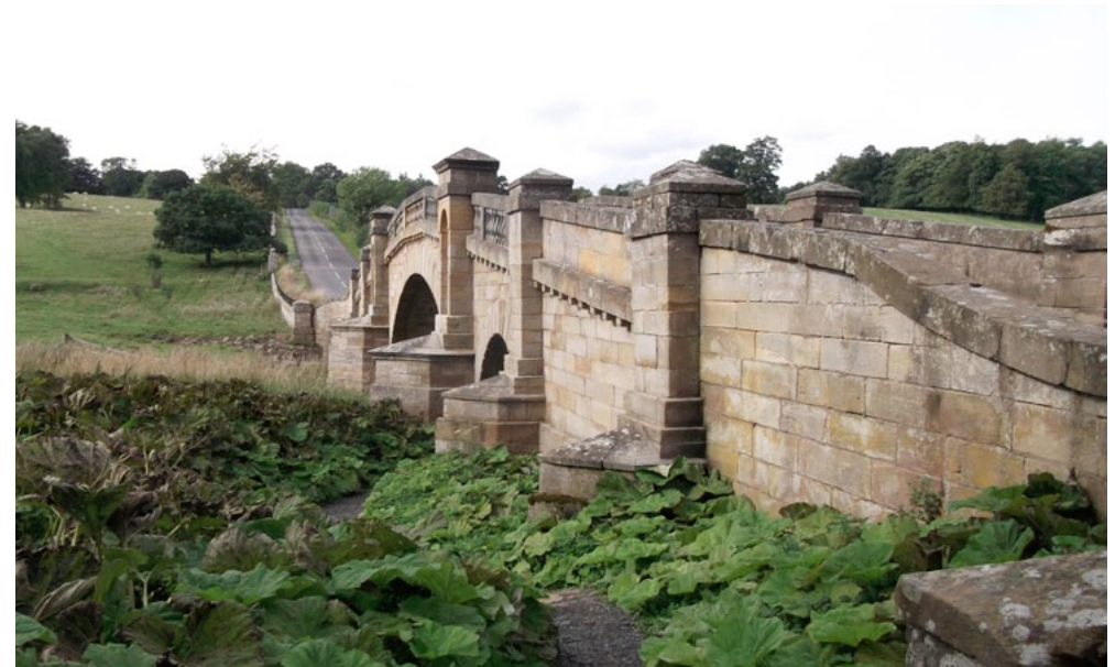
Bridge over the River Wansbeck, Wallington.

the A68, A696 and A697 have brought a corresponding decline since the 1960s in the measures of tranquillity and the extent of 'undisturbed' countryside. Quarrying for open cast coal and hard rock has been active in the area from the late 18th century, and occasionally before; there are no active open cast coal sites remaining, some are now restored, while a number of large hard rock quarries remain active in the southern part of the NCA. Growth in the renewable energy sector, particularly wind energy, has introduced this new element in the landscape. Some of the early trials in wind energy technology were carried out in the NCA in the Kirkheaton area; today the pattern of wind energy developments tends to be single or small clusters of turbines.