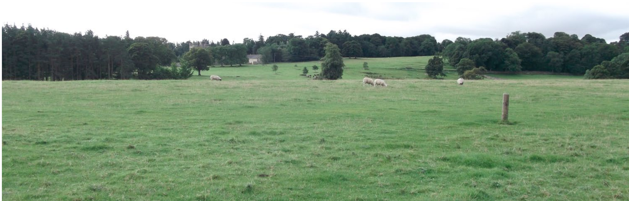
Country houses and fortified defensive structures, typically set in landscaped parklands.

Biodiversity and geodiversity are crucial in supporting the full range of ecosystem services provided by this landscape. Wildlife and geologically-rich landscapes are also of cultural value and are included in this section of the analysis. This analysis shows the projected impact of Statements of Environmental Opportunity on the value of nominated ecosystem services within this landscape.