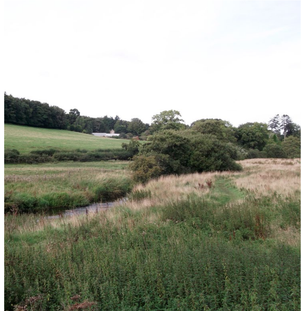
The National Trust's Wallington Estate walled garden and greenhouses - country houses are characteristic of the area, typically set within designed parklands or ornamental woodlands.