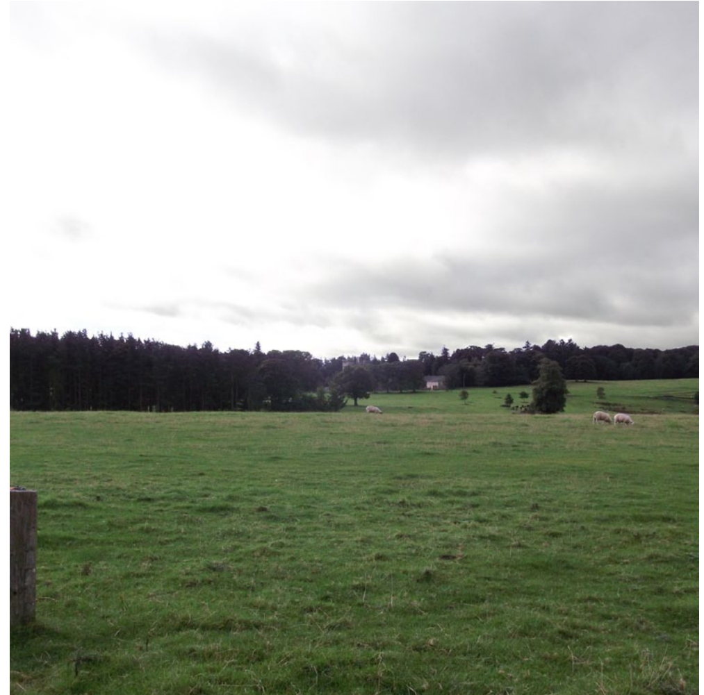
Country houses and fortified defensive structures, typically set in landscaped parklands.