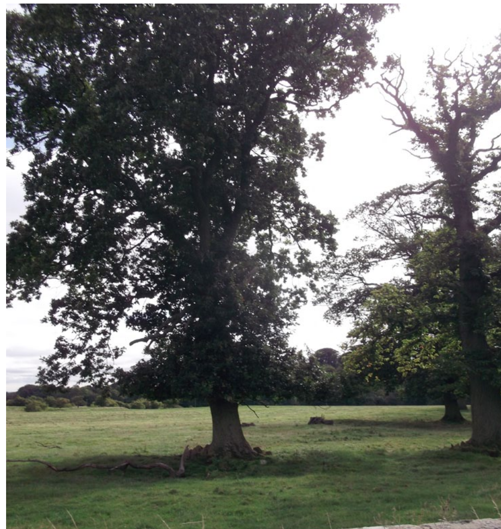
Mixed woodland and parkland within country estates.

Please note: Common Land refers to land included in the 1965 commons register; CROW = Countryside and Rights of Way Act 2000; OC and RCL = Open Country and Registered Common Land.