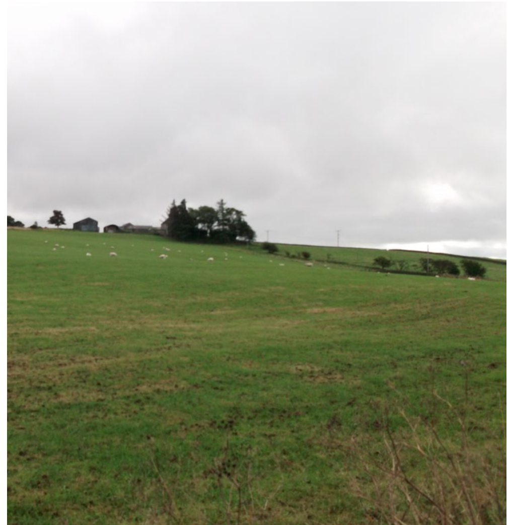
Small woodland shelterbelt around exposed farm buildings.

The A68 and A696 transport corridors reflect the general west-to-east connectivity and the A1 and A697 create a strong north-south link. The dominant orientation of landform here, dipping gently to the North Sea, can create particularly striking views from east to west, looking inwards to and outwards from this NCA, including occasional glimpses of the sea and coast. The Tyne Gap and Hadrian's Wall NCA forms the southern boundary.