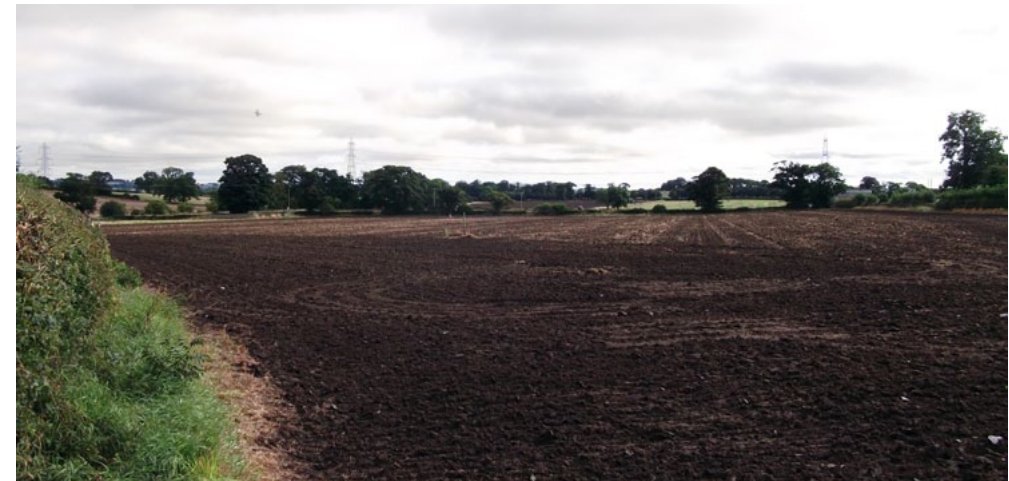
Deposits of glacial till give rise to relatively fertile soils which support managed grasslands and arable farming.