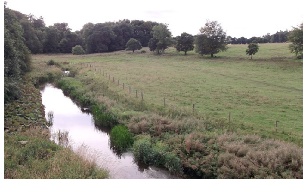
The River Wansbeck is home to species such as the black necked grebe and white clawed crayfish.