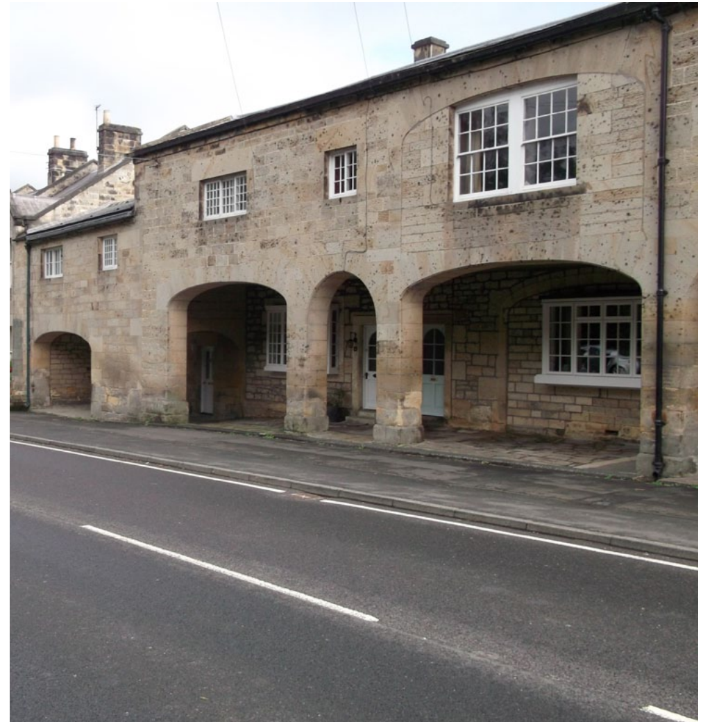
Belsay - buildings constructed from warm fell sandstone.