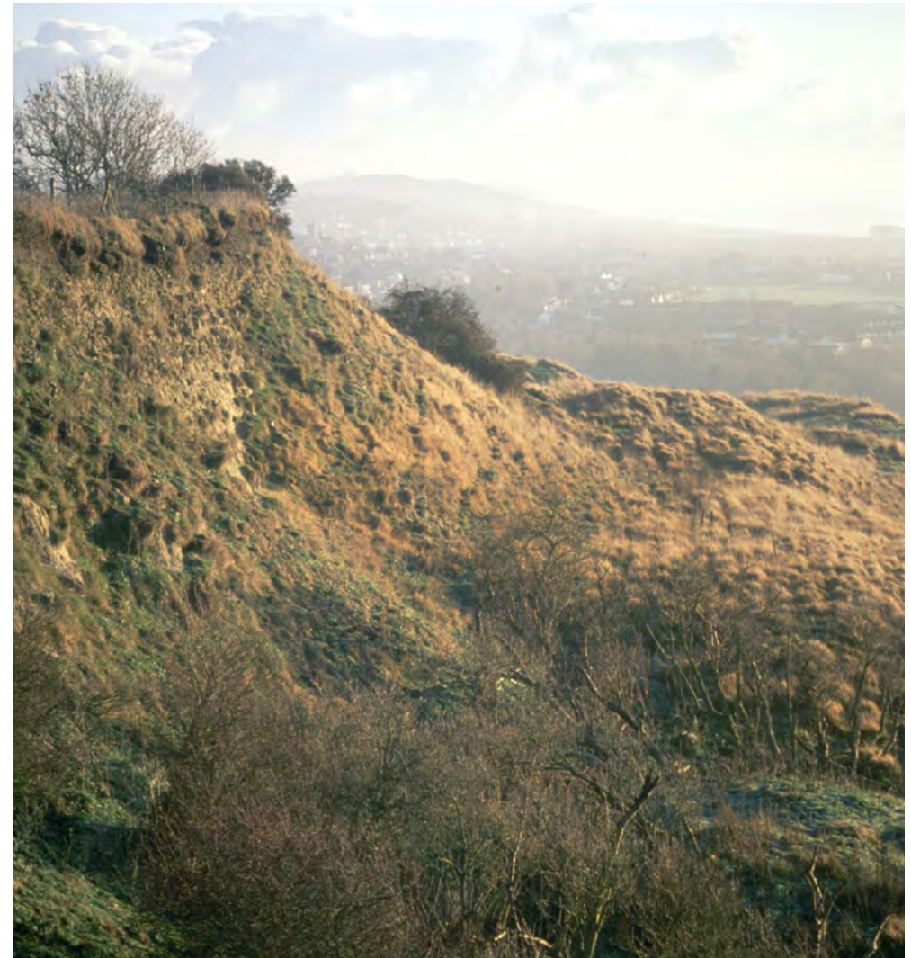
View along the Lymgne escarpment.

Besides the woodland, the Surrey Greensand is characterised by open rolling farmland. In the south, a traditional farmscape of small fields and thick hedgerows is retained. On flatter land, however, arable use is more prevalent. This area is heavily populated with settlements such as Redhill, Reigate and Dorking.