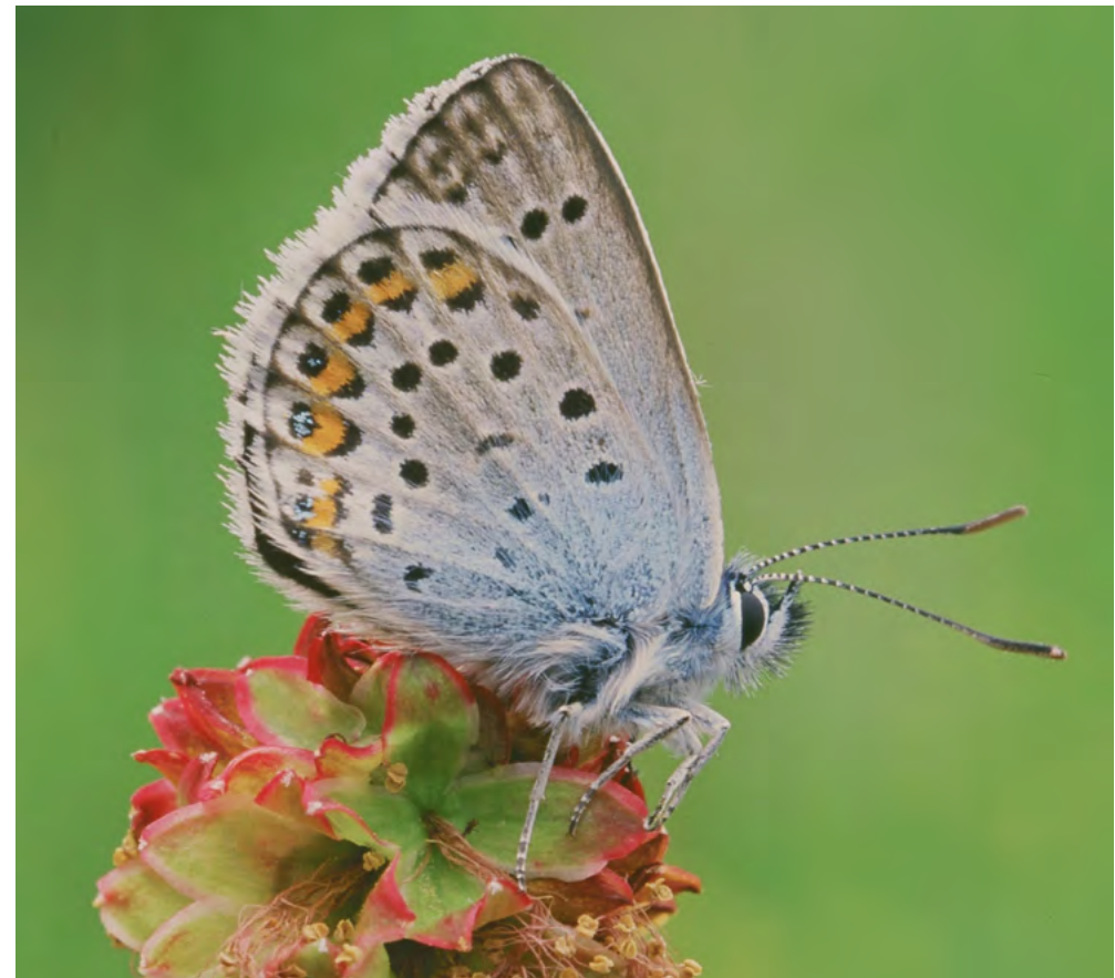
Silver-studded blue butterfly.

Biodiversity and geodiversity are crucial in supporting the full range of ecosystem services provided by this landscape. Wildlife and geologically-rich landscapes are also of cultural value and are included in this section of the analysis. This analysis shows the projected impact of Statements of Environmental Opportunity on the value of nominated ecosystem services within this landscape.