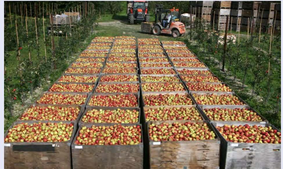
Apple harvest at Blackmoor Estate, Hampshire.