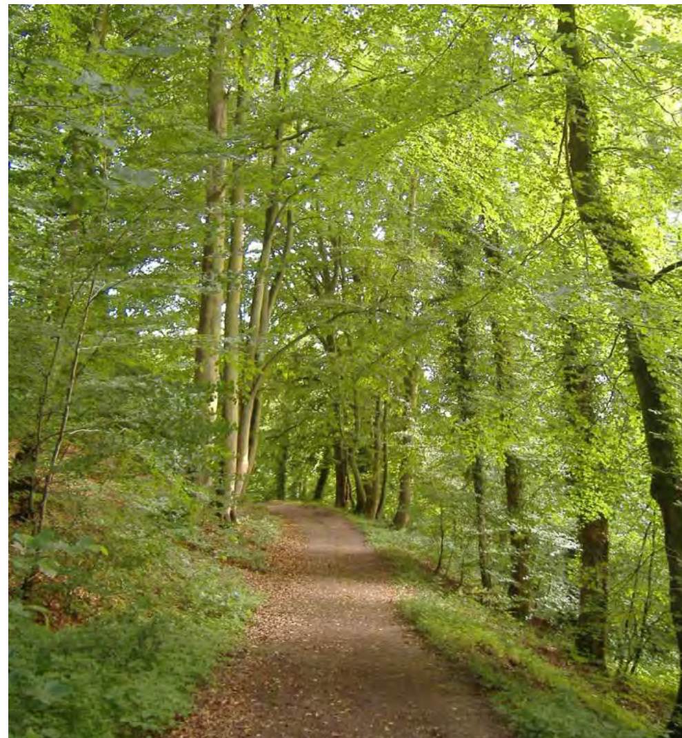
Priory lane at Selborne.