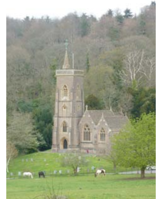
St. Etheldreda (also known as St. Audries) near West Quantoxhead village, is a typical sandstone-built church with a perpendicular tower; a prominent and characteristic feature of the small settlements and hamlets of the area.

The M5 cuts through the south-eastern edge of the NCA while the A39, A38, A358 and A3259 connect the north and south of the NCA by way of Taunton and Bridgwater.