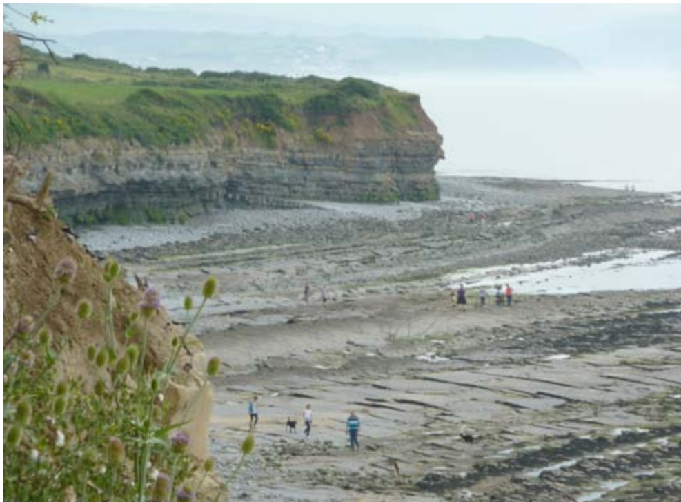
The coastline viewed from Kilve showing the low cliffs and distinctive geology, and the limestone grassland on the fringes of the cliff tops.

Based on the CPRE map of tranquillity (2006) it seems that much of the NCA is disturbed; a reflection of the larger settlements, numerous settlements and road (M5) and rail infrastructure running through the area. It is at its most tranquil to the west of Wellington around the Tone valley.