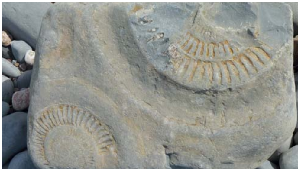
An ammonite found on the beach, which forms part of the Somerset Jurassic Coast, and a key feature of this coastline's SSSI designation.

There are 35 Local Geological Sites within the NCA.