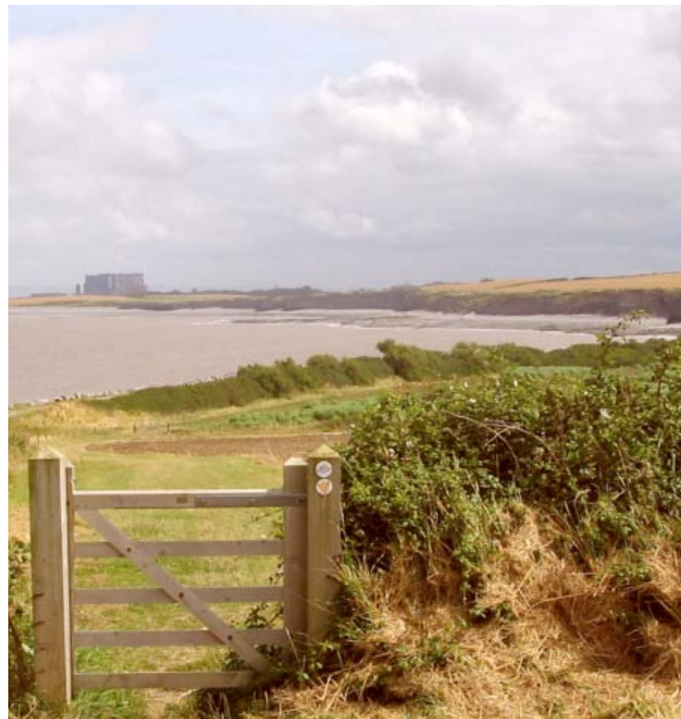
View from the route of the West Somerset Coast Path at Lilstock, Bridgwater Bay. Hinkley Point power station is in the distance.

Please note: Common Land refers to land included in the 1965 commons register; CROW = Countryside and Rights of Way Act 2000; OC and RCL = Open Country and Registered Common Land.