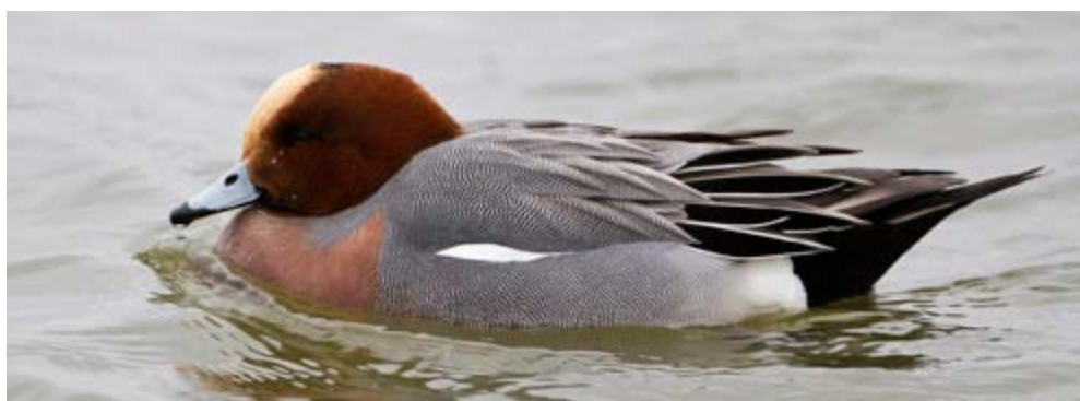
Wigeon feeding on the mudflats, are regularly winter visitors to Bridgewater Bay and are one of the birds that make up Bridgewater Bay SPA.