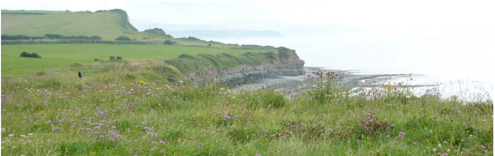
Limestone grassland fringes the Somerset Jurassic Coast cliffs, particularly between Kilve and East Quantoxhead, providing a nectar-rich habitat for invertebrates.

Biodiversity and geodiversity are crucial in supporting the full range of ecosystem services provided by this landscape. Wildlife and geologically-rich landscapes are also of cultural value and are included in this section of the analysis. This analysis shows the projected impact of Statements of Environmental Opportunity on the value of nominated ecosystem services within this landscape.