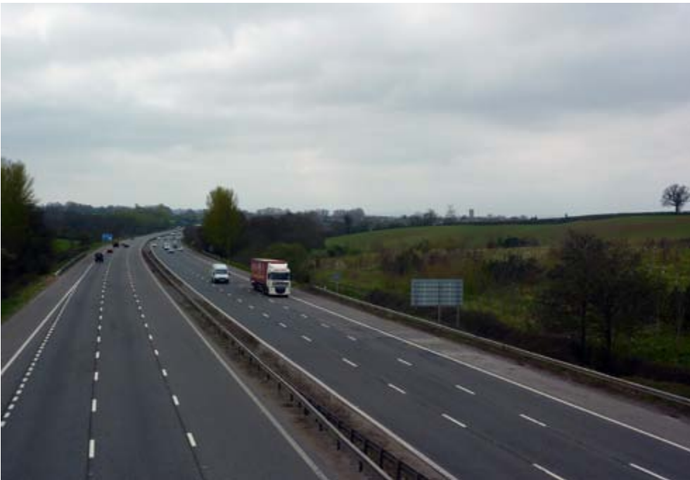
The M5 motorway corridor, which passes through the south-east edge of the NCA and exerts a strong influence over much of the southern part of the Vale of Taunton.

The poets Wordsworth and Coleridge frequented the area. Coleridge wrote The Rime of the Ancient Mariner while travelling through Watchet, and Shurton Bars, to the west of Hinkley Point, inspired his poem to his fiancée Lines Written at Shurton Bars .