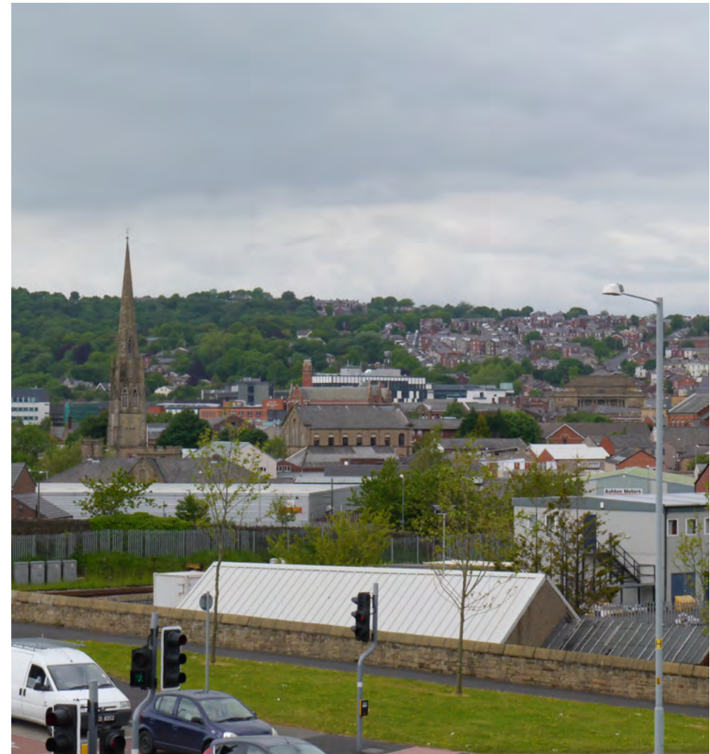
The area has a strong urban character.