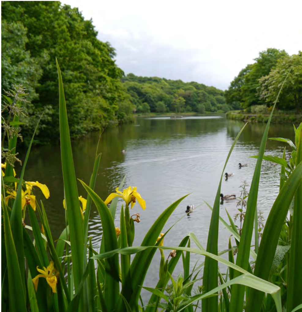
A former mill lodge - Big Lodge, Yarrow Valley Country Park.