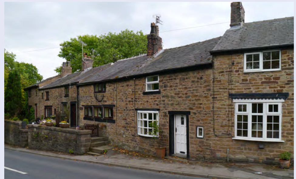
Traditional stone-built weavers' cottages.