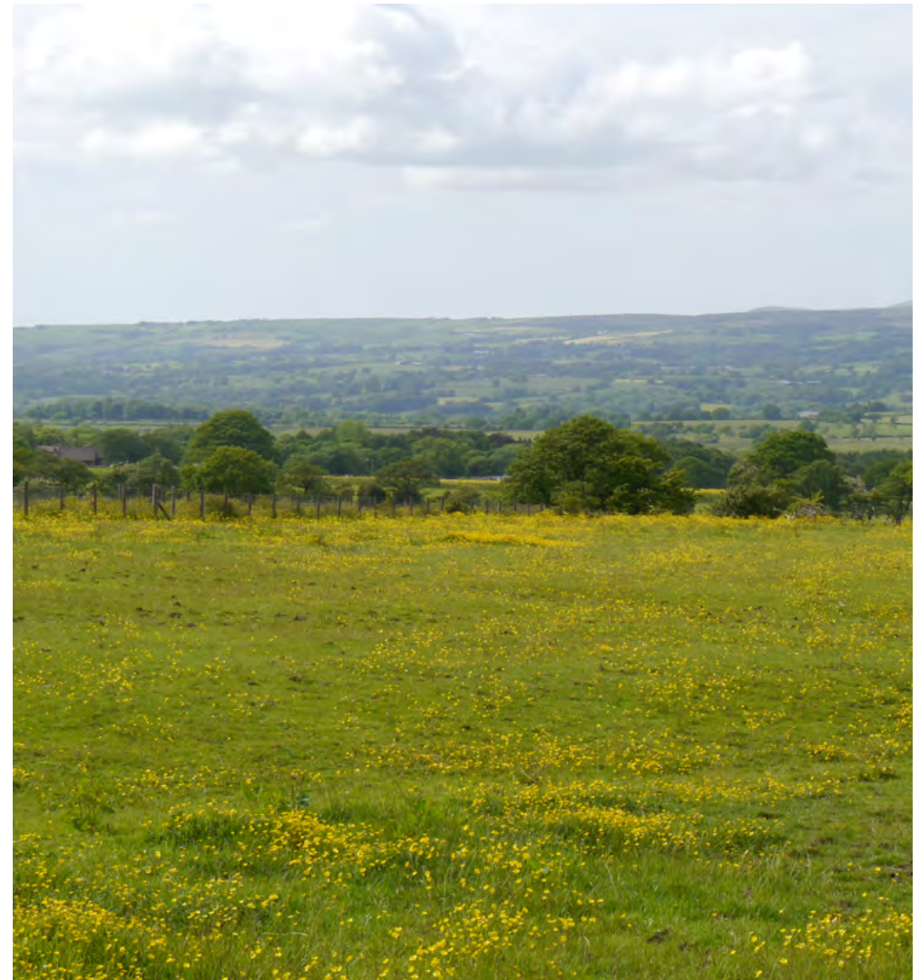
View looking north from Langho. The top of the Bowland Fells can just be glimpsed.