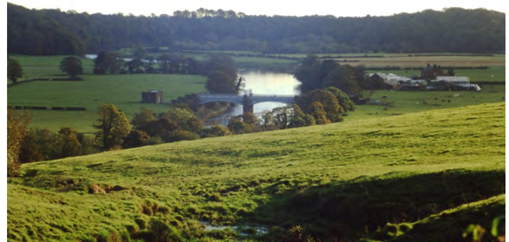
River Ribble at Salmsbury Bottoms.

Many important communication routes pass through the NCA, including the Leeds and Liverpool Canal, the Preston–Colne rail link and the M6, M61 and M65 motorways.