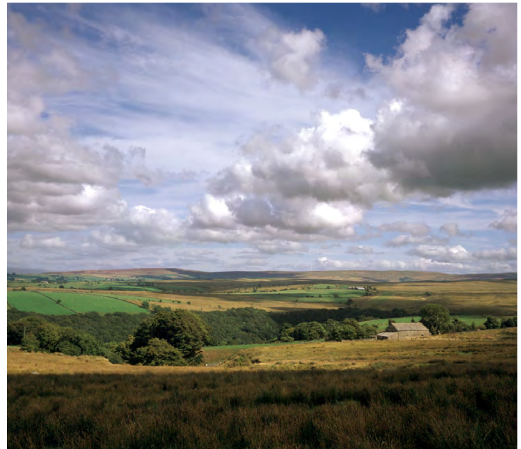
View across Roeburn Valley.

Biodiversity and geodiversity are crucial in supporting the full range of ecosystem services provided by this landscape. Wildlife and geologically-rich landscapes are also of cultural value and are included in this section of the analysis. This analysis shows the projected impact of Statements of Environmental Opportunity on the value of nominated ecosystem services within this landscape.