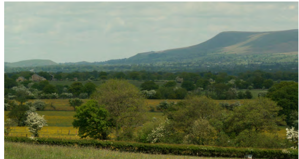
Pendle Hill from Copster Green.

This development began as a cottage industry during the 16th century with weaving rather than spinning. Traditionally, wool came from the Southern Pennine hillsides and flax from the low-lying country of the Lancashire and Amounderness Plain around Rufford and Croston. By 1700 each district was specialising in the production of one type of cloth. Blackburn was a centre for fustians, and most woollens and worsteds were manufactured in Burnley and Colne. The textile industry grew rapidly and, with new machines, the domestic system was replaced by factory systems which further accelerated the growth of these weaving communities. Nucleated settlements, developed from the late 18th century, were built around factory locations. These dominate the main north-east to south-west route alongside the Ribble flood plain and between the forests of Pendle and Trawden. Regular, imposing stone terraces were built to accommodate textile workers in the 19th century.