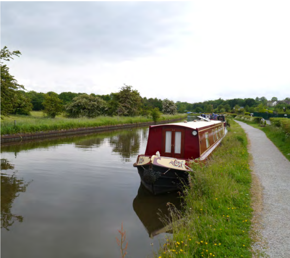
Leeds to Liverpool Canal, passing through agricultural land near the M61, Chorley.

The Lancashire Valleys are concentrated in a broad trough that runs north-eastwards from Chorley to Skipton.