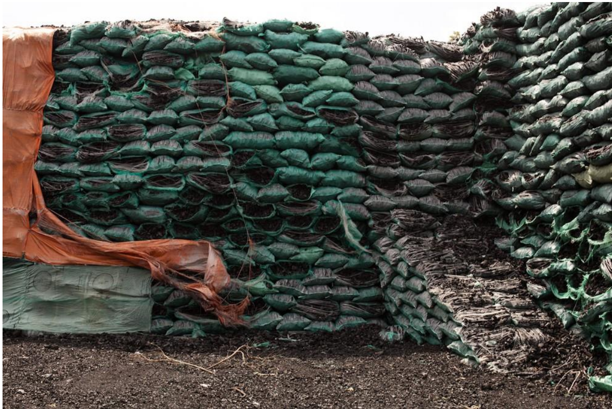
Charcoal Ready for Export

The most rapid degradation has been of forest and range resources that provide the raw material production of charcoal in Somalia - extracted predominantly from slow growing dry deciduous bush land and thicket species of Acacia and Commiphora .