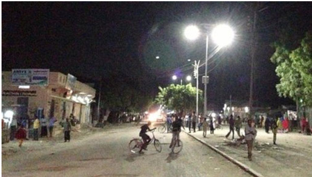
Solar Street Lights in Mogadishu

Solar energy including: street lighting, private homes use and plans of Benadir Electric Company (BECO) to add three solar sub-stations into its Mogadishu grid, are good beginning. In addition, in Somaliland and Puntland, the use of solar energy in private residences is on the increase. Therefore, given the high potential of solar energy in Somalia, with estimated capacity of 2,163,991,069 MWh/year, the government in partnership with the private sector should formulate policies and projects to extend the technology to rural towns and communities. Samples of the solar street lights, in Mogadishu, which could be replicated, are indicated below and costing need to be determined once project scope is known.