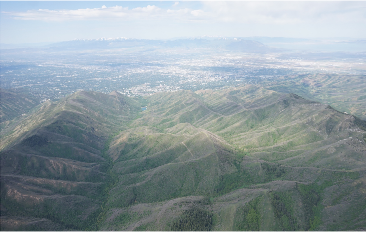
Above: Looking west across the Red Butte flight box with Salt Lake City and the Salt Lake Valley beyond.