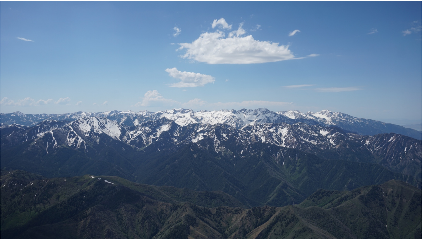
Below: Snowcapped peaks of the Wasatch range above Salt Lake Valley and just south of the Red Butte watershed.