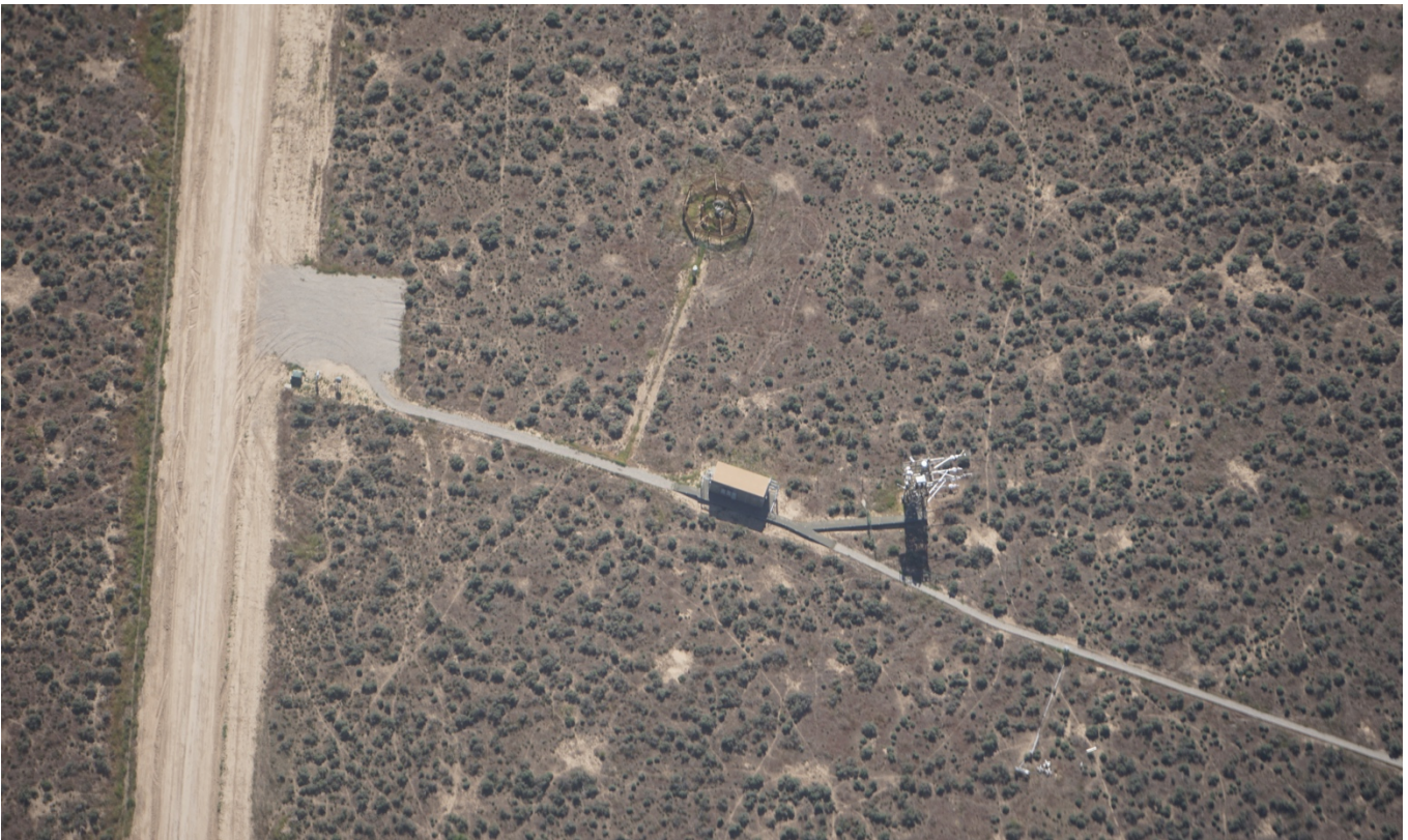
Below: NEON tower and DFIR at ONAQ