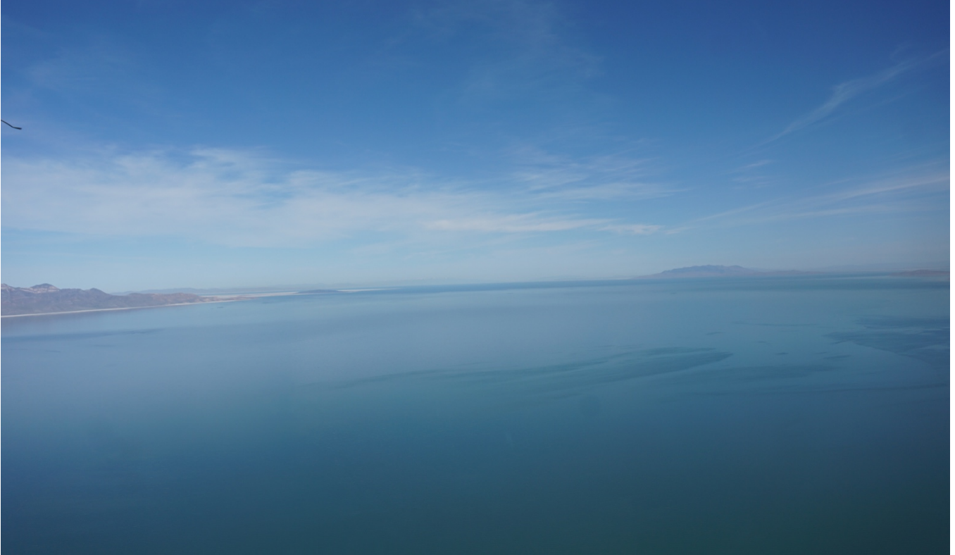
Above:View of the Great Salt Lake, visable during the transit to ONAQ