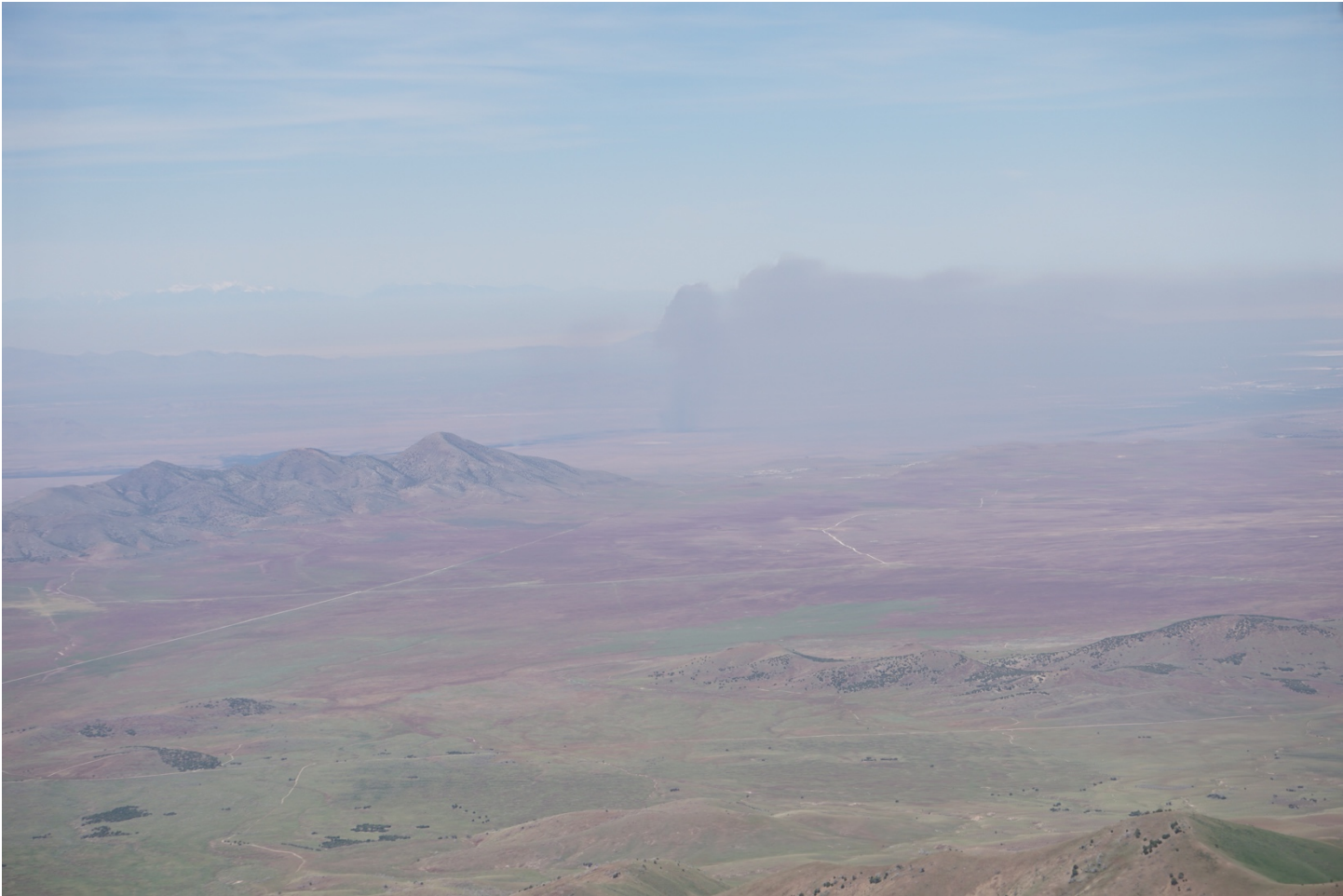
Above: Smoke plume visible in the distance, to the west of the flight box. Flight crew was unsure if smoke impacted spectrometer collect, but made note of in logs.