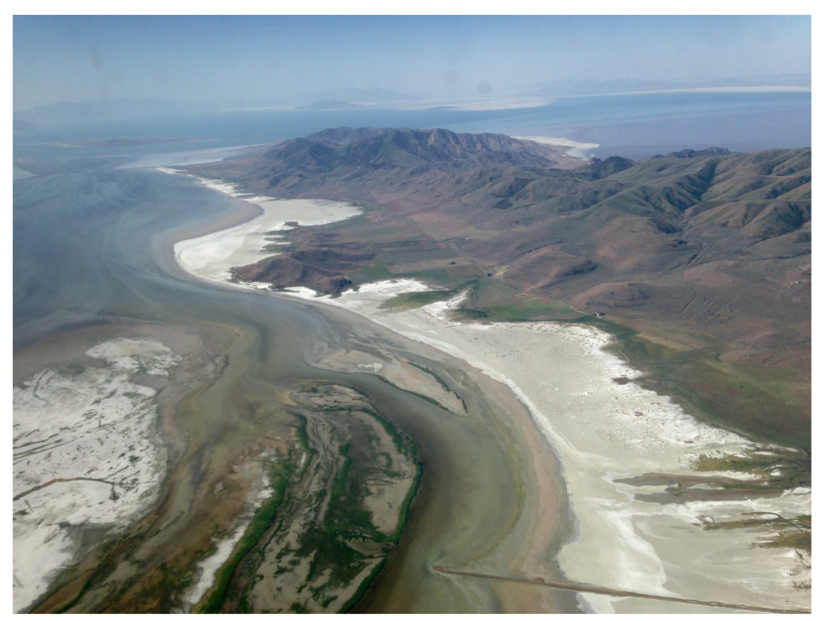
Figure 1. Promontory Mountains and Bear River Migratory Bird Refuge, UT