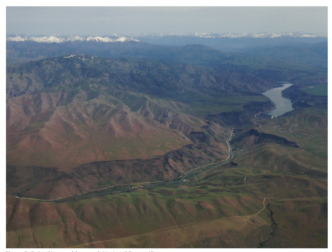
Figure 2. Boise River and Sawtooth National Forest, ID