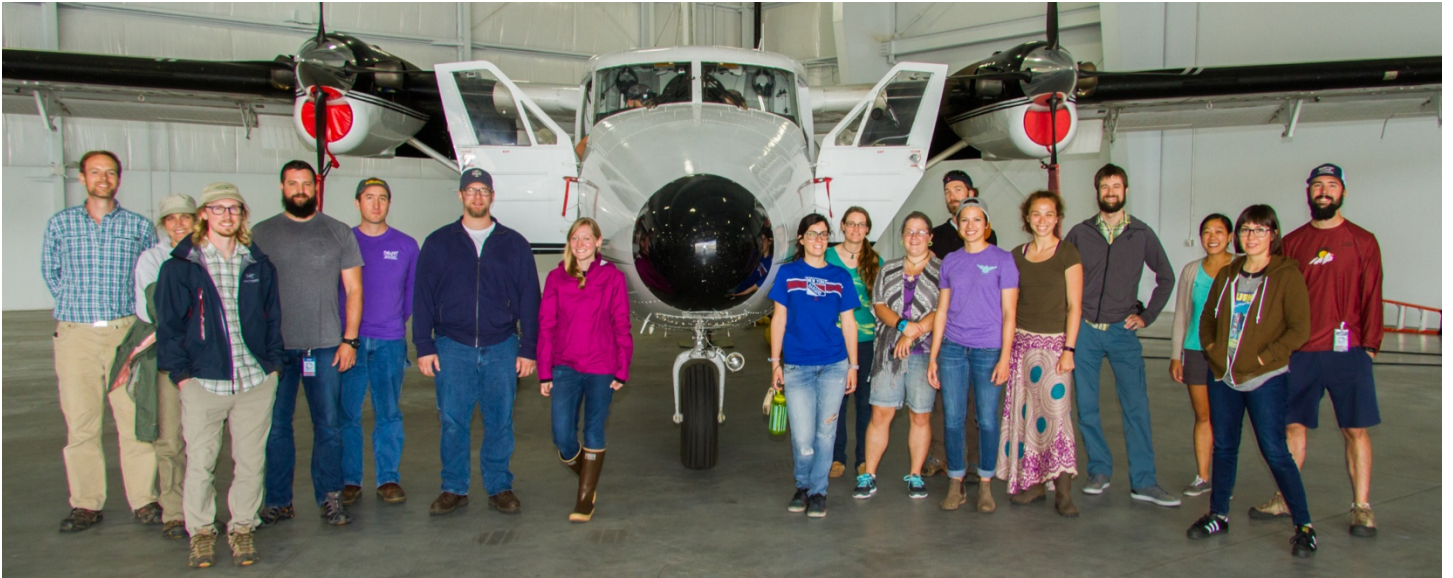
Above: D16 staff meet with the flight crew to check out the Otter.