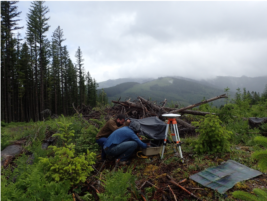
Figure 1. Matt and Mitch at the Abby Road site, WA