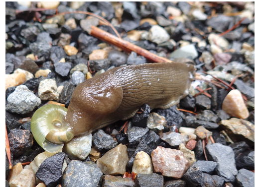
Figure 3. A very happy banana slug